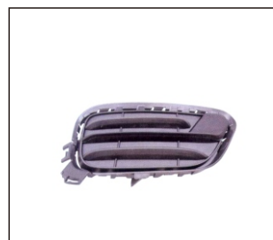
FOG LAMP COVER 901G.BM07911GA R:51117347946 L:51117347945