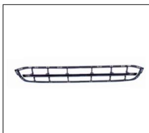
BUMPER GRILLE 901G.BM07913GA OE:5111-9477-653