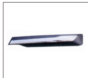
IMPACT STRIP 911.BM44162 R:51119477644 L:51119477643