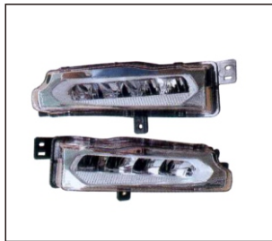
FOG LAMP 939.BM2042 R:63177412528 L:63177412527