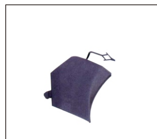
FRONT TRAILER COVER 901C.BM11043A OE:5111-9477-665