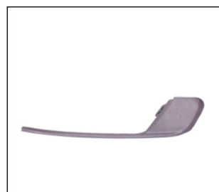
FOG LAMP FRAME STRIPE 923.BM98317 R:51117413922 L:51117413921