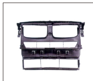
RADIATOR FRAME SUPPORT 904.BM30184A OE:5174-7210-176