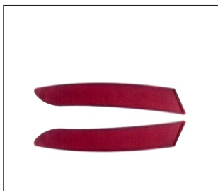
REAR BUMPER REFLECTOR 932.BM1416 R:63257352210 L:63257352209