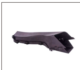
AIR CLEANER INTAKE AIR DUCT 911.BM44158 R:51747378074 L:51747378073