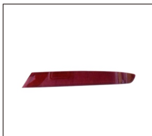
REAR BUMPER REFLECTOR 932.BM1417 R:63147419928 L:63147419927