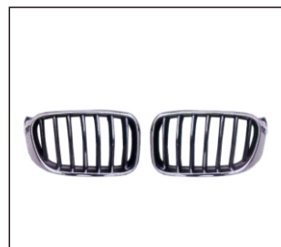
GRILLE X3/X4 900.BM07914GA R:51117338572 L:51117338571