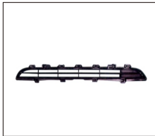
BUMPER GRILLE 901G.BM07912GA OE:5111-7338-493