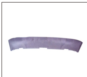
FRONT AIR DEFLECTOR 911.BM44159A OE:5111-7413-496