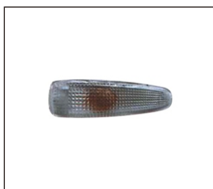
SIDE LAMP 932.MB7017A OE: