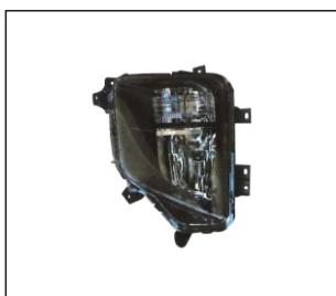
FOG LAMP W/ TURNING LAMP 939.MB7044 R: