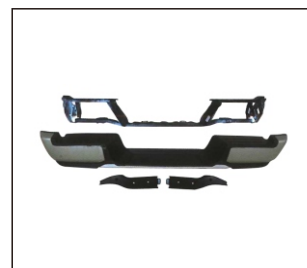
REAR BUMPER 901.MB07100BA OE: