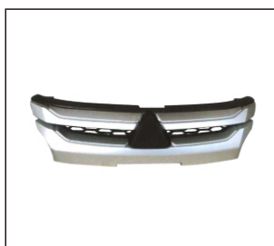
GRILLE SILVER HI-END TYPE 900.MB08031GA OE: