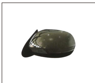
MIRROR CHROME COVER 980.MB157E R: