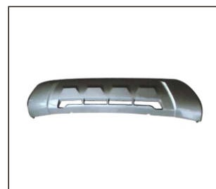
FRONT BUMPER UNDER COVER 957.MB22021A OE: