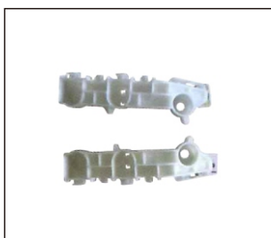
FRONT BUMPER BRACKET 911.MB44736 R: