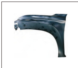
FRONT FENDER 905.MB10972A R: