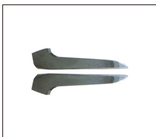
FRT BUMPER UNDER STRIP CHROME 923.MB7431 R: