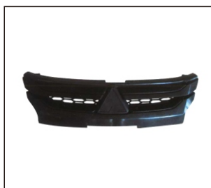
GRILLE BLACK 900.MB08032GA OE: