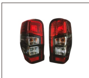
TAIL LAMP 931.MB7009 R: