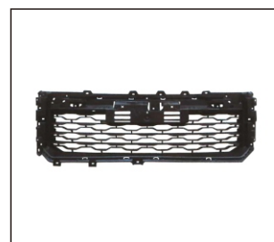
FRONT BUMPER GRILLE 901G.MB04109BA OE: