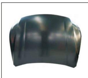
HOOD 902.MB29020A OE: