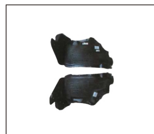
FRONT F. INNER FENDER 915.MB11121 R: