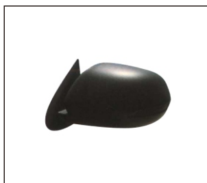
MIRROR BLACK 980.MB158E R: