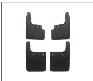
MUDGUARD SOUTH EAST ASIA TYPE 922.MB148714 OE:5370C123/ 5370C124 / 5370C135/ 5370C136