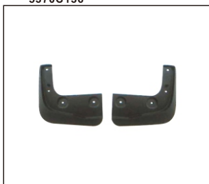
REAR MUDGUARD MIDDLE EAST TYPE 922.MB148715 OE:5370C132 & 5370C131