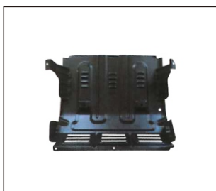
FRONT ENGINE METAL COVER 957.MB22022A OE: