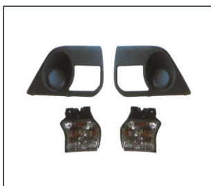
FOG LAMP COVER W/ TURNING LAMP 939.MB7045Z OE: