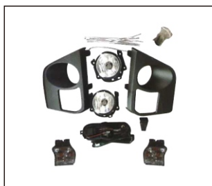
FOG LAMP SET W/ WIRING 939.MB7046Z OE: