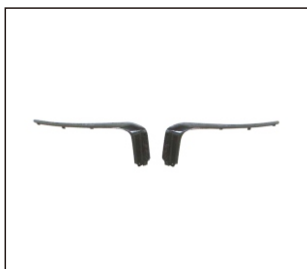
FRT BUMPER UPPER STRIP CHROME 923.MB7430 R: