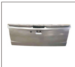
TRUNK LID 928.MB90696A OE: