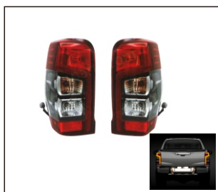
TAIL LAMP LED 931.MB7008 R: