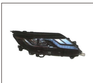
HEAD LAMP LUXURY TYPE 930.MB7407 R: