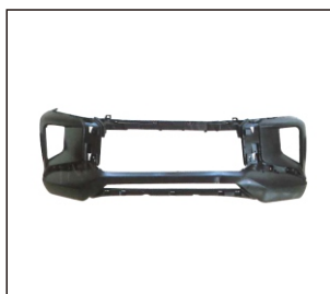
FRONT BUMPER 901.MB07099BA OE: