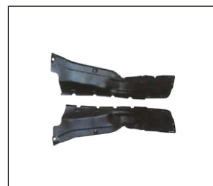
FRONT R. INNER FENDER 915.MB11122 R:

All trademarks and vehicle models (including their names and pictures) mentioned in this catalogue are for reference only. Our production is not original replacement parts but interchangeable against original parts.