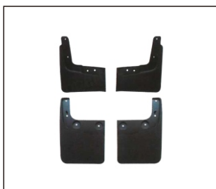
MUDGUARD THAI TYPE 922.MB148713 OE:5370C127/ 5370C128/ 5370C135/ 5370C136