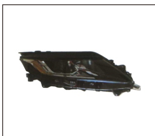
HEAD LAMP 930.MB7408 R: