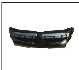
GRILLE CHROME 900.MB08033GA OE: