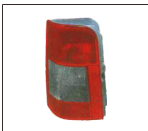
TAIL LAMP (1 DOOR) 931.PG1922 552-1922 R 18447 L 18446