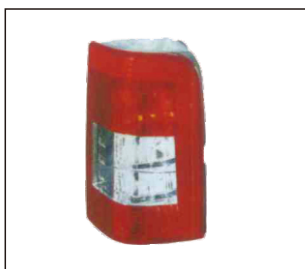
TAIL LAMP CRYSTAL 931.PG1925 552-1925 R 8351Y9 L 8350Y9