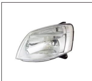
HEAD LAMP 930.PG1118 R:9644150880 L:9644150980