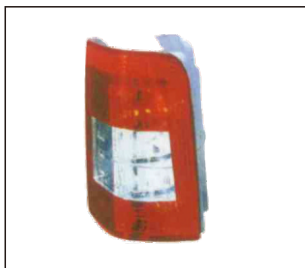
TAIL LAMP CRYSTAL 931.PG1924 R 6351Y8 L 6350Y8