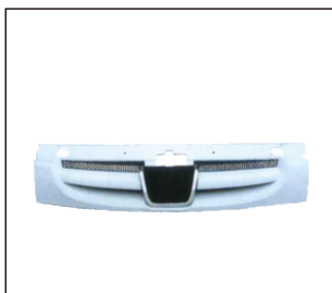
GRILLE 900.PG07100GA OE: