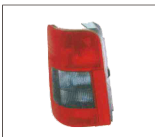
TAIL LAMP (2 DOOR) 931.PG1909 552-1909 R 18441 L 18440