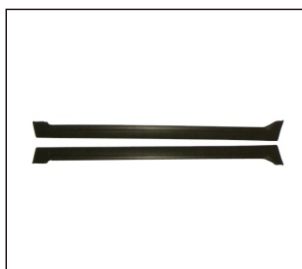
SIDE SKIRT 908.NS52006A R:76850-JN90A L:76851-JN20A