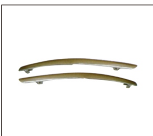
FRONT BUMPER MOULDING 923.NS2010 R:62074-JN00A L:62075-JN00A