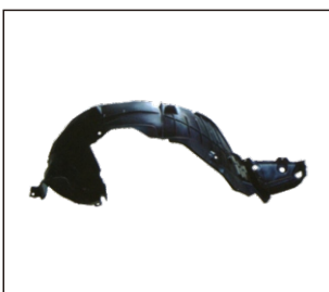
INNER FENDER 915.NS11097 R:63840-JN00A L:63841-JN00A