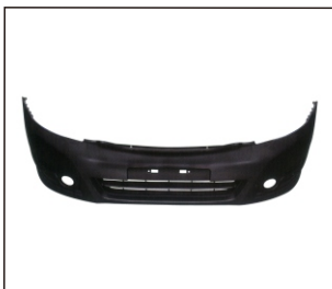
FRONT BUMPER 901.NS07930BA(w/ WASHER HOLE) 901.NS07930BB(w/o WASHER HOLE) OE:62022-JN00H