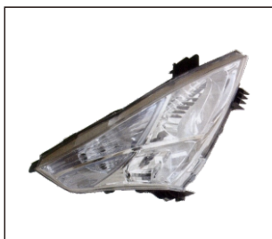
HEAD LAMP 930.NS1122E R:26025-JN90A L:26075-JN90A