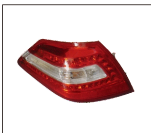
TAIL LAMP 931.NSB229 R:26550-JN00A-A124 L:26555-JN00A-A124