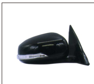
MIRROR ELECTRIC, FOLDABLE 980.NS271E-1 980.NS271E-2 W/HEATER R:96301-JN00A L:96302-JN00A