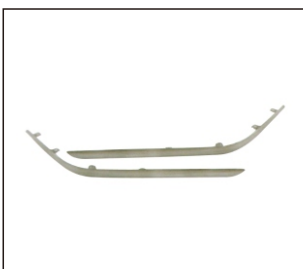
REAR BUMPER MOULDING 923.NS2011 R:65074-JN00A L:65075-JN00A