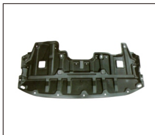
COVER, ENGINE UNDER 957.NS22015A OE:75892-JN00A