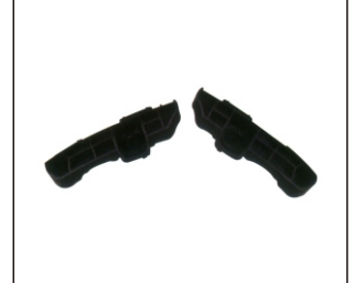
FRONT BUMPER BRACKET 911.TY44309A R: