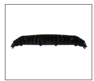
WATER TANK COVER DOWN 911.TY44313A OE: