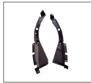
WATER TANK COVER UPPER 911.TY44312A R: