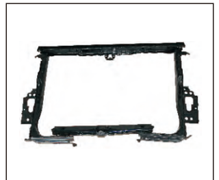
RADIOTOR SUPPORT 904.TY30357A OE: