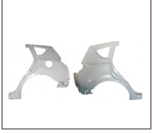
REAR FENDER 905.TY21004A R:

All trademarks and vehicle models (including their names and pictures) mentioned in this catalogue are for reference only. Our production is not original replacement parts but interchangeable against original parts.