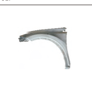
FRONT FENDER 905.TY21017A R: