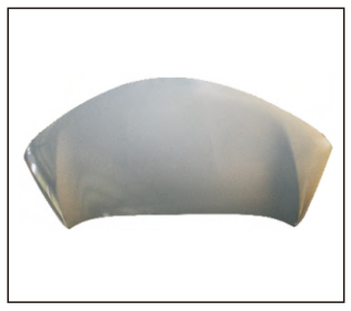
HOOD 902.TY31002A OE: