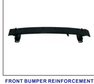
FRONT BUMPER REINFORCEMEN 911.TY44106A OE: