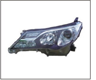
HEAD LAMP 930.TY7032 R