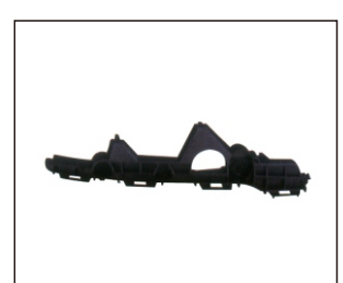
REAR BUMPER BRACKET 911.TY44310A OE: