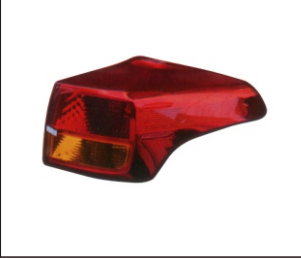
TAIL LAMP MIDDLE EAST TYPE 931.TY7074 R