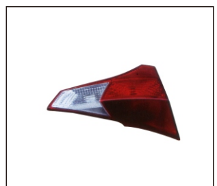
BACK LAMP 933.TY7324 R: