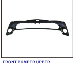
FRONT BUMPER UPPER 901.TY05176BA OE: