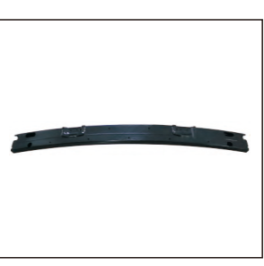
REAR BUMPER REINFORCEMENT 911.TY44295A OE: