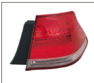
TAIL LAMP 931.TYA971 R: