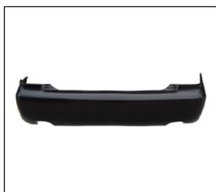
REAR BUMPER 901.TY05143BA OE: