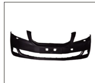
FRONT BUMPER 901.TY05144BA OE: