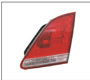
BACK LAMP 933.TY7316 R: