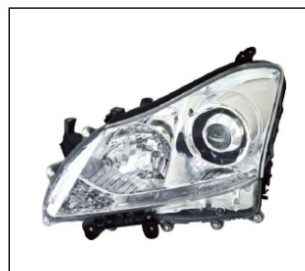
HEAD LAMP 930.TY040 R