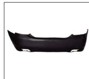
REAR BUMPER 901.TY05145BA OE: