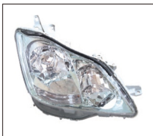
HEAD LAMP 930.TY7039 R