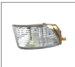
FOG LAMP 939.TY7122 R: