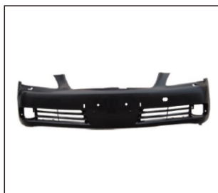
FRONT BUMPER 901.TY05142BA OE: