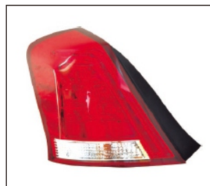
TAIL LAMP 931.TY7066 R: