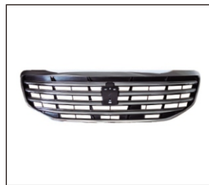
GRILLE 900.TY08035GA R: