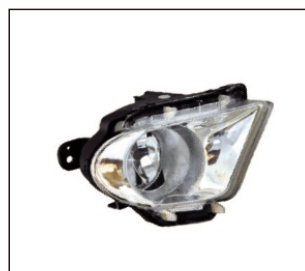
FOG LAMP 939.TY7123 R: