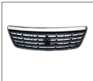
GRILLE 900.TY08034GA OE: