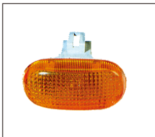
SIDE LAMP 932.SZ1407X OE:36410-75F00