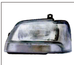
HEAD LAMP 930.SZ1119 R 35100F-77A01 L 35300F-77A01