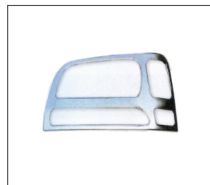
HEAD LAMP RIM OE: