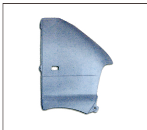
FENDER 905.SZ11001 OE: