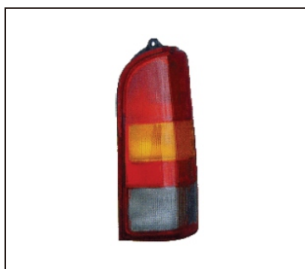
TAIL LAMP 931.SZ1943 OE: