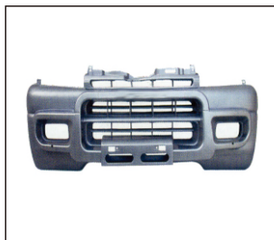
FRONT BUMPER 901.SZ04374BA OE: