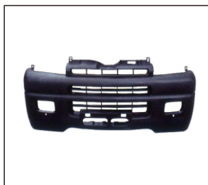
FRONT BUMPER 901.SZ04375BA OE: