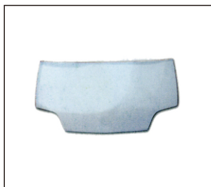
HOOD 902.SZ29001A OE: