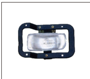
FOG LAMP 939.SZ2004 OE: