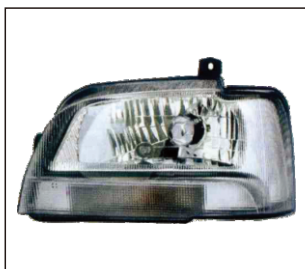
HEAD LAMP 930.SZ1118 R 35100F77A01AA L 35300F77A01AA