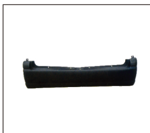
REAR BUMPER 901.SZ04373BA OE: