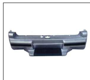
REAR BUMPER 901.SZ04376BA OE: