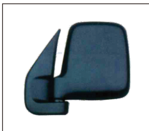
MIRROR 980.SZ996 OE: