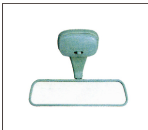
INSIDE MIRROR 980.SZ994 OE: