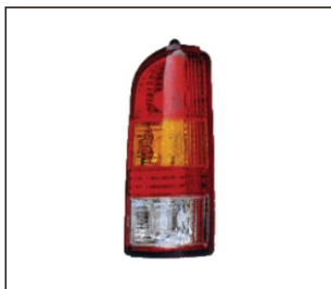
TAIL LAMP 931.SZ1942 OE: