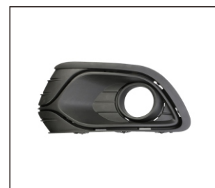
FOG LAMP COVER 913.RN1002 R:263316043R L:263363542R