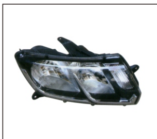
HEAD LAMP 6PIN (RUSSIA) 930.DAE612 R: