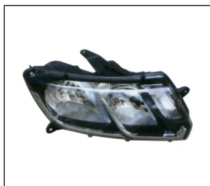
HEAD LAMP 5PIN 930.RN7003 R: