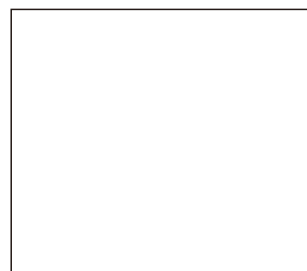
FOG LAMP COVER 913.RN1005 R:261A29847R L:261A39630R