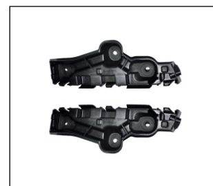
REAR BUMPER BRACKET 911.RN44007 R:850459808R L:850448811R