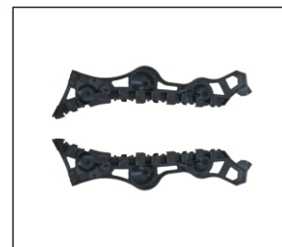
FRONT BUMPER BRACKET 911.RN44006 R:631433758R L:631427092R