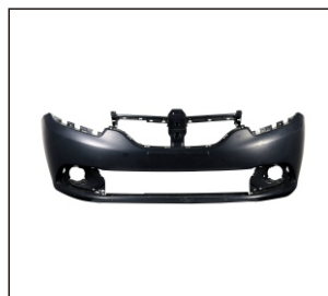
FRONT BUMPER 901.RN05004BA OE:620228143R / 620223795R