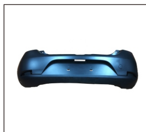
REAR BUMPER 901.RN05005BA OE:850221967R