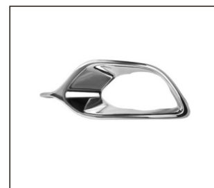
FOG LAMP COVER 913.RN1003 R:261A28558R L:261A37963R

All trademarks and vehicle models (including their names and pictures) mentioned in this catalogue are for reference only. Our production is not original replacement parts but interchangeable against original parts.