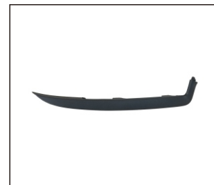
HEAD LAMP STRIPE 923.RN04007 OE:260E07324R