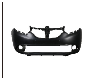
FRONT BUMPER 901.RN05003BA OE:620227557R / 620226895R