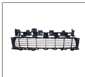
BUMPER GRILLE 901G.RN07038GA OE:622543229R