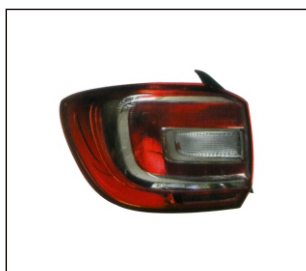
TAIL LAMP 931.RN1002 R: