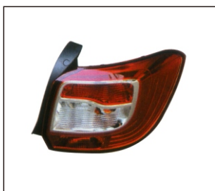
TAIL LAMP 931.DA19A6 R: