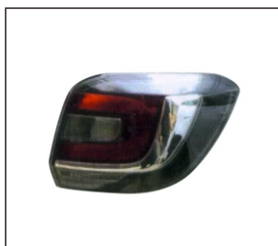
TAIL LAMP BLACK 931.RN1004 R: