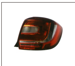
TAIL LAMP SMOKE/RED 931.RN1003 R: