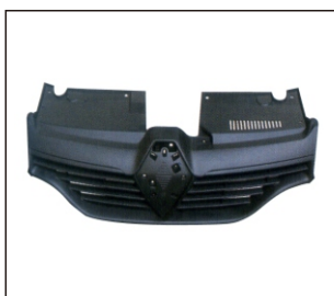
GRILLE 900.DA07096GA OE: