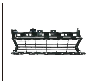
BUMPER GRILLE 901G.RN07037BA OE:682542439R