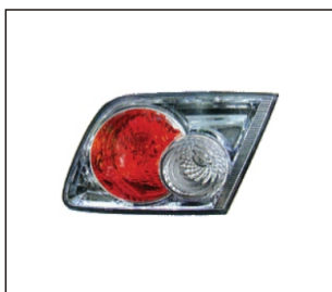
BACK LAMP 933.MZ2956 R:GJ6E513F0D L:GJ6E513F0D