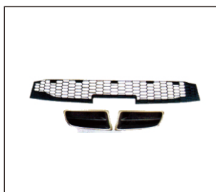
BUMPER GRILLE 901G.MZ99090GA OE: