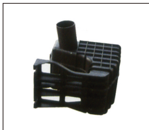
AIR FILTER HOUSING 241.MZ1003 OE: