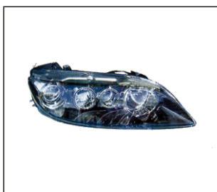
HEAD LAMP 930.MZ1148 OE: