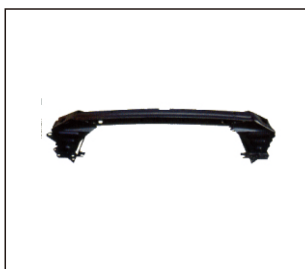
FRONT BUMPER REINFORCEMENT 911.MZ44087A OE:G31A-50-070