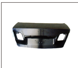
TRUNK LID 928.MZ90821A OE: