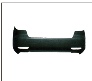
REAR BUMPER 901.MZ04904BA OE: