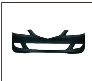
FRONT BUMPER 901.MZ04903BA OE: