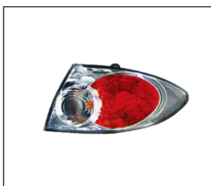
TAIL LAMP 931.MZ1956 R:22061971R L:22061871L