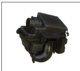
AIR FILTER HOUSING 241.MZ1004 OE: