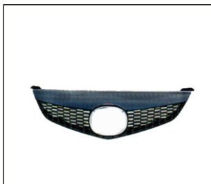
GRILLE 900.MZ07903GA OE:GKZA50710B