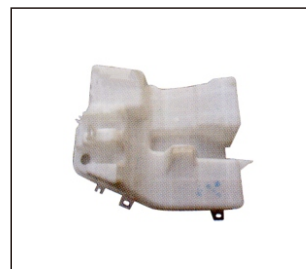
SPARE TANK 509.MB1132A OE: