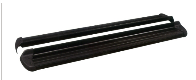
SIDE STEP BOARD 920.MB99008A OE: