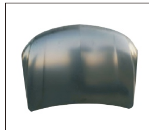
HOOD 902.MB29011A OE: