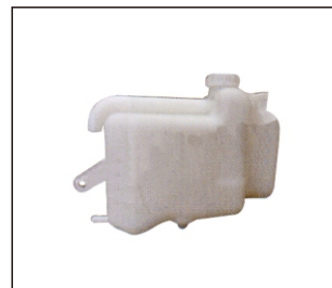
WINDSHIELD WASHER 509.MB1133A OE: