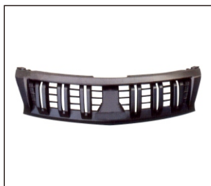
GRILLE 900.MB08023GA OE: