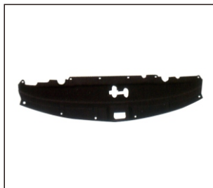
RADIATOR TOP COVER 911.MB44735A OE: