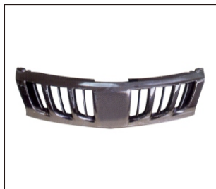
GRILLE 900.MB08022GA OE: