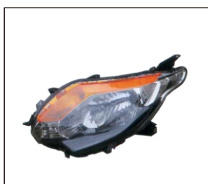
HEAD LAMP BLACK 930.MB7493 R: