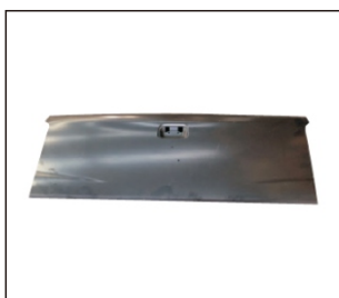
TRUNK LID 928.MB90685A OE:6724A143