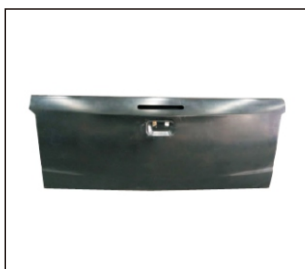
TRUNK LID 928.MB90686A OE:6724A145