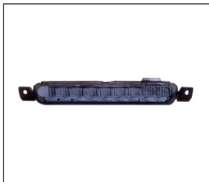
3RD BRAKE LAMP 940.MB6117 OE: