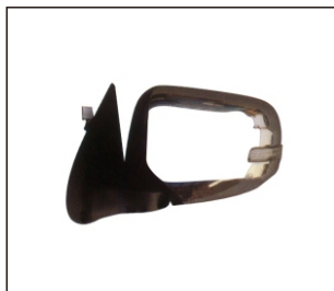
FAN SHROUD 980.MB156E OE: MN135052