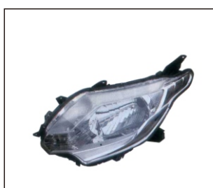
HEAD LAMP 930.MB7494 R: