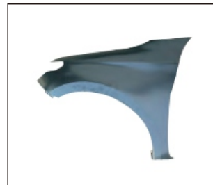
FRONT FENDER 905.MB10955A W/ S.LAMP HOLE 905.MB10955B W/O S.LAMP HOLE OE: