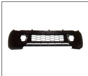
FRONT BUMPER 901.MB07092BA OE: