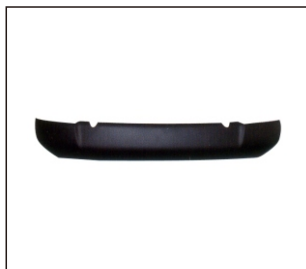
BUMPER BOARD 901.MB07093BA OE: