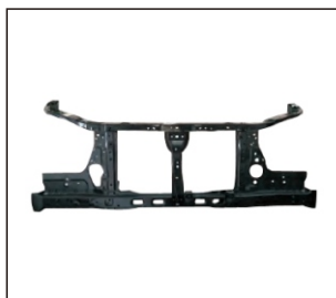
RADIATOR SUPPORT 904.MB30153A OE: