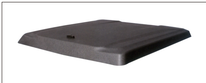
PICK UP COVER 848.MB1001 OE