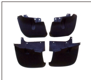
MUDGUARD 922.MB9904Z OE: