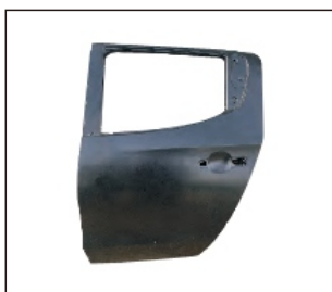
REAR DOOR 907.MB28338A R: