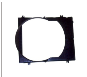
FAN SHROUD 512.MB1131A OE: