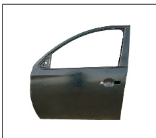
FRONT DOOR 907.MB28337A R: