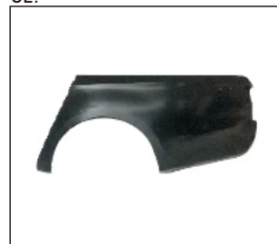
REAR FENDER 905.MB10959A R:

All trademarks and vehicle models (including their names and pictures) mentioned in this catalogue are for reference only. Our production is not original replacement parts but interchangeable against original parts.