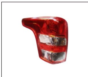
TAIL LAMP 931.MB7005 R: