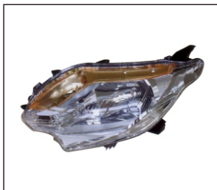
HEAD LAMP 930.MB7491 R: