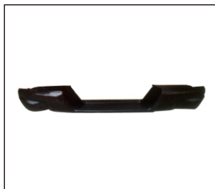
REAR BUMPER 901.MB07094BA OE: