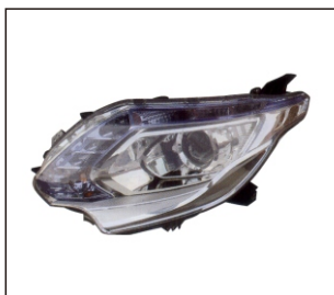
HEAD LAMP 930.MB7492 R: