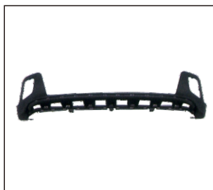
FRONT BUMPER LOWER 901.KA05036BA OE