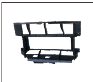
WATER TANK UPPER PANEL 911.KA44750A OE