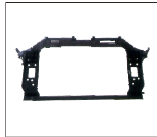
RADIATOR SUPPORT 904.KA33018A OE: