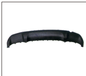
REAR BUMPER LOWER BOARD 903.KA05011A OE: