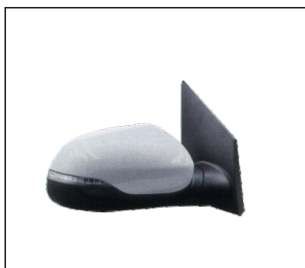
MIRROR ELECTRIC W/LAMP 980.KA120E R: