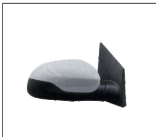
MIRROR ELECTRIC 980.KA119 R: