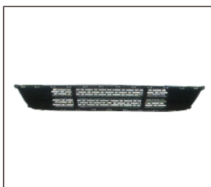
BUMPER GRILLE 901G.KA04317BA OE