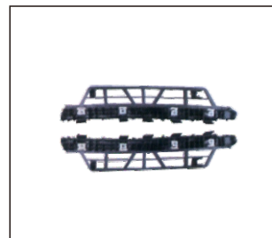
REAR BUMPER BRACKET 911.KA44749 R:

All trademarks and vehicle models (including their names and pictures) mentioned in this catalogue are for reference only. Our production is not original replacement parts but interchangeable against original parts.