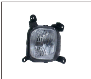
FOG LAMP 939.KA7033 R:92202-D8000 L:92201-D8000