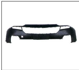
FRONT BUMPER UPPER 901.KA05035BA OE: