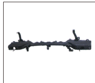
REAR BUMPER REINFORCEMENT 911.KA44747A OE: