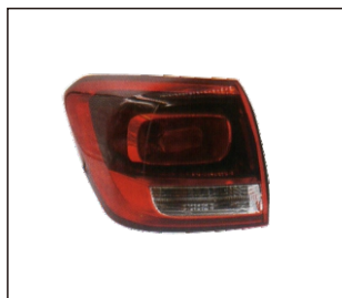
TAIL LAMP 931.KA7015 R:92402-D8000 L:92401-D8000