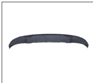
FRONT BUMPER LOWER BOARD 903.KA05010A OE: