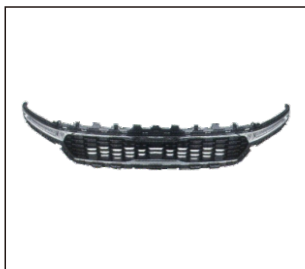
GRILLE 900.KA08029GA OE: