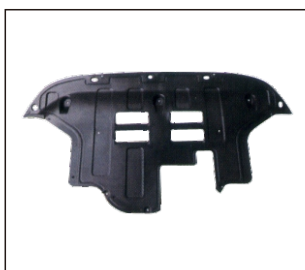
COVER, ENGINE UNDER 957.KA22004A OE