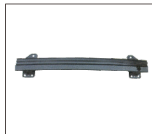
FRONT BUMPER REINFORCEMENT 911.KA44746A OE: