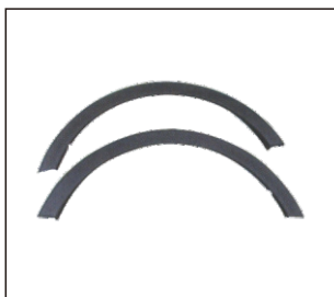
FENDER TRIM 943.KA12001 OE: