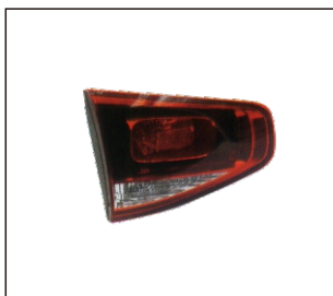
BACK LAMP 933.KA7210 R:92404-D8000 L:92403-D8000