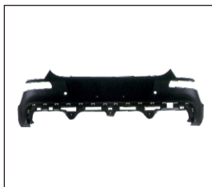
REAR BUMPER 901.KA05037BA OE: