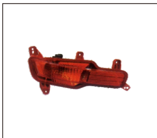
REAR BUMPER LAMP 932.KA7009 R: