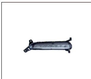
DAYLIGHT RUNNING LAMP 932.KA7008 R:9