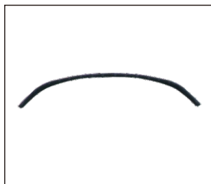
FRONT BUMPER LOWER MLDG 903.KA05012A OE