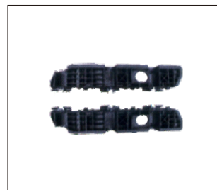
FRONT BUMPER BRACKET 911.KA44748A R: