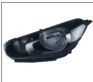
HEAD LAMP 930.KA7031 R:92102-D8000 L:92101-D8000