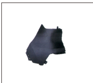
REAR SIDE BUMPER 912.KA41003A R: