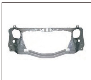
RADIATOR SUPPORT 904.IZ30004A OE: