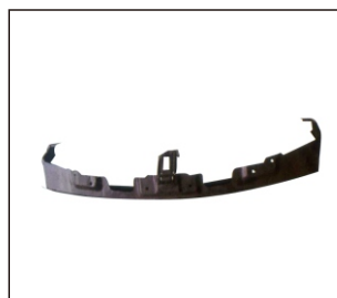
FONT BUMPER SUPPORT IRON 911.IZ44105A OE: