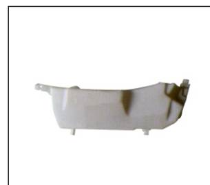
WINDSHIELD WASHER 509.IZ5003 OE: