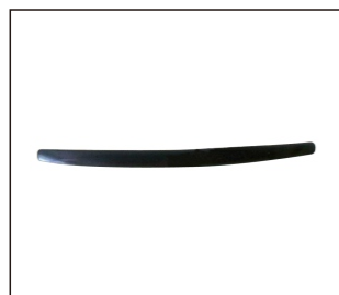
HOOD MOULDING BLACK 923.IZ3009A OE: