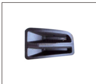
FOG LAMP COVER 2WD 913.IZ7418 R: