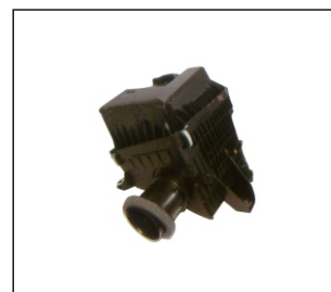
AIR FILTER CASE 241.IZ1002A OE:

All trademarks and vehicle models (including their names and pictures) mentioned in this catalogue are for reference only. Our production is not original replacement parts but interchangeable against original parts.