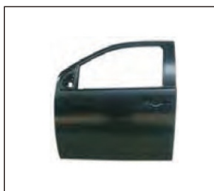
FRONT DOOR 907.IZ28222A R: