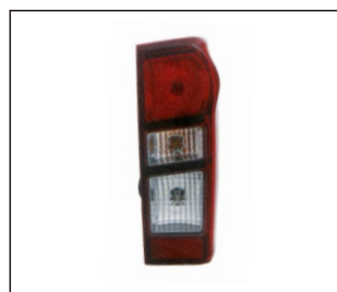
TAIL LAMP 931.IZC139 R:8981254023 L:8981254033