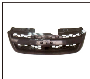
GRILLE BLACK 900.IZ07966GA OE: