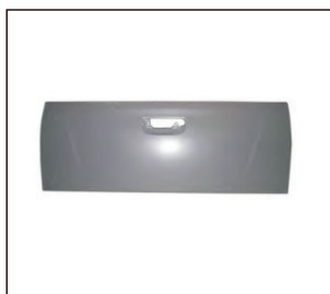
TAIL GATE 928.IZ91100A OE: