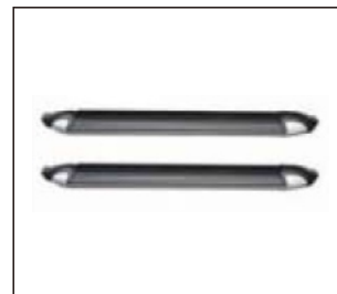
SIDE STEP 920.IZ3803 OE: