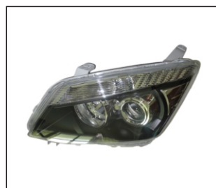
HEAD LAMP 930.IZC949 R:8981253825 L:8981253835