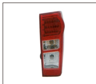
TAIL LAMP LED 931.IZC140 R:8981253983 L:8981253993