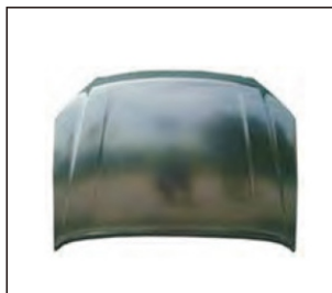
HOOD 902.IZ20100A OE: