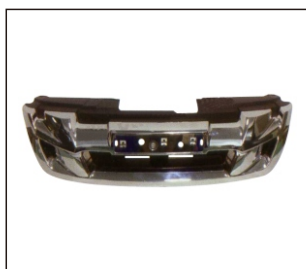
GRILLE CHROME 4WD 900.IZ07960GA OE:8981938690