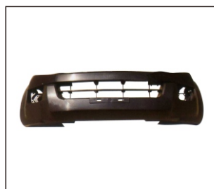
FRONT BUMPER 901.IZ41017BA OE:8-98196573-0