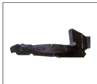
INNER FENDER 4WD 915.IZ11011 R: