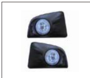
FOG LAMP 939.IZ7002 OE: