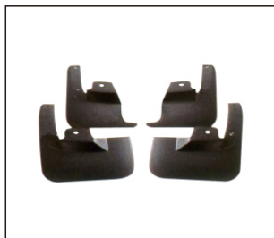
MUDGUARD 922.IZ9102Z OE: