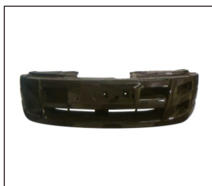
GRILLE BLACK 2WD 900.IZ07959GA OE:8-98193870-0