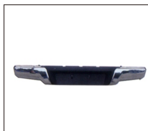
REAR BUMPER 901.IZ41018BA OE: