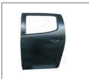
REAR DOOR 907.IZ28223A R: