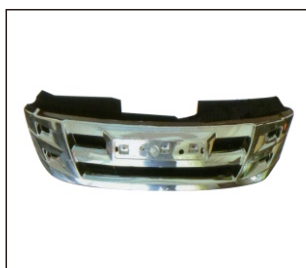
GRILLE CHROME 2WD 900.IZ07972GA OE: