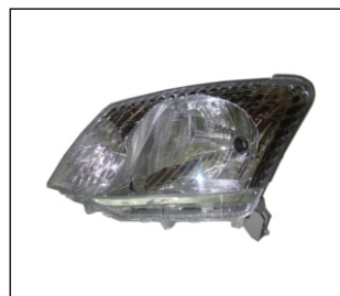
HEAD LAMP 930.IZC947 R:8981253915 L:8981253925