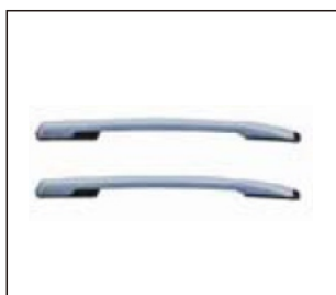
LUGGAGE CARRIER 817.IZ1101 OE: