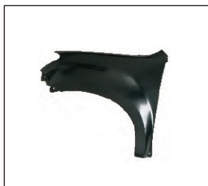
FRONT FENDER 905.IZ21008A 2WD 905.IZ21002A 4WD