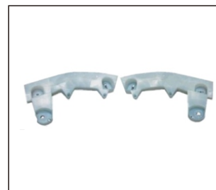
FRONT BUMPER BRACKET 911.IZ44097 OE: