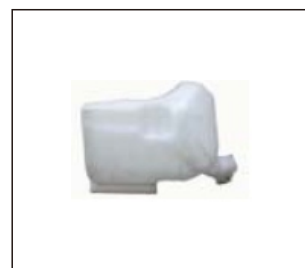
SPARE TANK 511.IZ9001 OE: