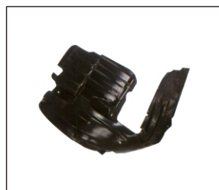
INNER FENDER 2WD 915.IZ11012 R: