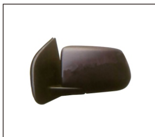
MIRROR 980.IZ714 R: