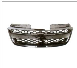
GRILLE CHROME 900.IZ07971GA OE: