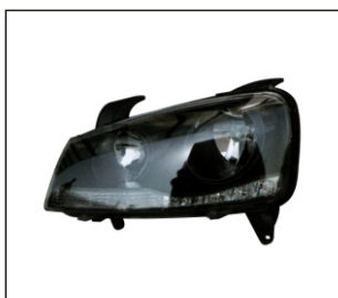
HEAD LAMP ELECTRIC 930.GW1030E R: