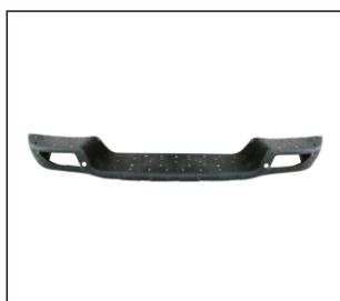
REAR BUMPER 901.GW04059BA OE: