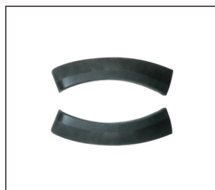
FENDER TRIM 943.GW12006A R: