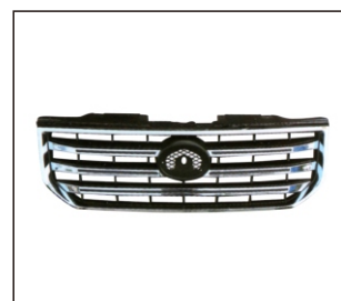
GRILLE 900.GW07034GA OE: