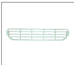
BUMPER GRILLE 901G.GW05011BA OE: