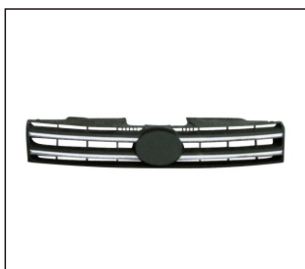
GRILLE 900.GW07033GA OE: