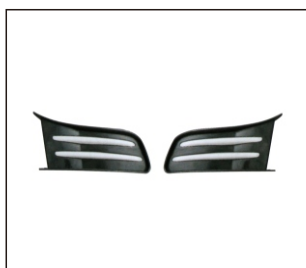
BUMPER GRILLE 901G.GW05017BA R: