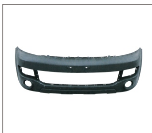
FRONT BUMPER 901.GW04058BA OE: