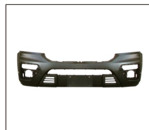
FRONT BUMPER 901.GW04060BA OE: