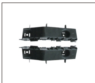
FRONT BUMPER BRACKET 911.GW44045A R: