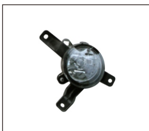
FOG LAMP 939.GW2028 R: