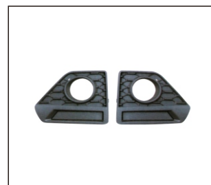
FOG LAMP COVER 913.GW0725 R:

All trademarks and vehicle models (including their names and pictures) mentioned in this catalogue are for reference only. Our production is not original replacement parts but interchangeable against original parts.