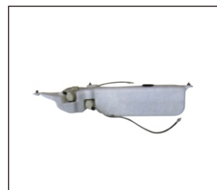
WINDSHIELD WASHER 509.GW1001A OE: