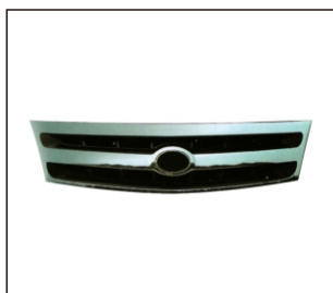
GRILLE 900.GW07002GA OE: