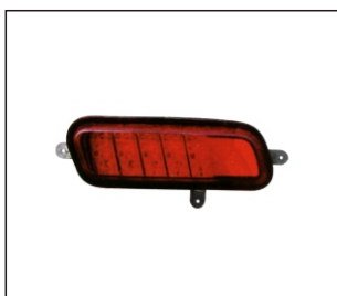
REAR BUMPER LAMP 932.GW2012 R: