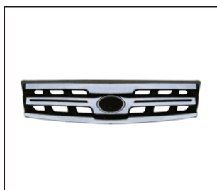
GRILLE 900.GW07001GA OE: