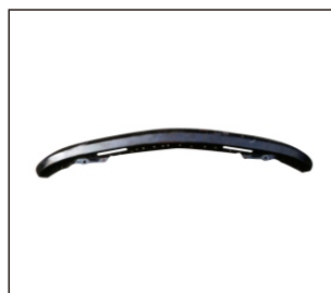
FRONT BUMPER SUPPORT 911.GW44001A OE: