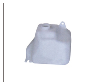
WINDSHIELD WASHER 511.GW1001A OE: