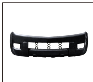
FRONT BUMPER 901.GW04001BA OE: