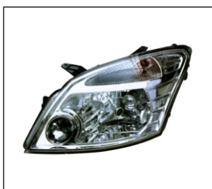
HEAD LAMP 930.GW1001 R: