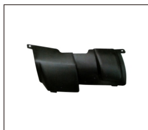
FRONT BUMPER APRON 903.GW05001 OE: