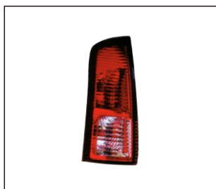
TAIL LAMP UPPER 931.GW3001 R: