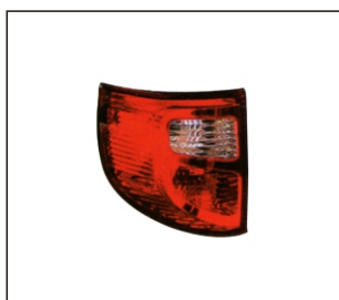
TAIL LAMP LOWER 931.GW3002 R: