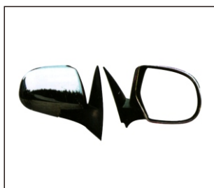
MIRROR 980.GW001 R: