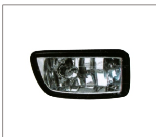
FOG LAMP 939.GW2001 R: