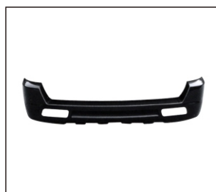
REAR BUMPER 901.GW04002BA OE: