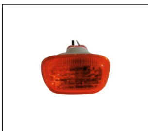
SIDE LAMP 932.GW1001X R: