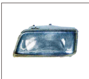
HEAD LAMP 930.FT5617 661-1122 R:318016324 L:318016323