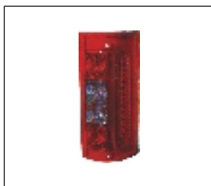
TAIL LAMP 931.FT1932 R:1328427080 L:1328428080