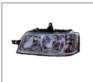
HEAD LAMP MANUAL 930.FTA677 550-1130 OE: