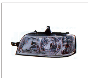
HEAD LAMP ELECTRIC 930.FTA677E R:1337815080 L:1337816080