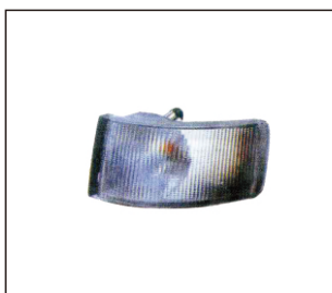
CORNER LAMP 938.FT5617 661-1517-UE R:LLB071 L:LLB072