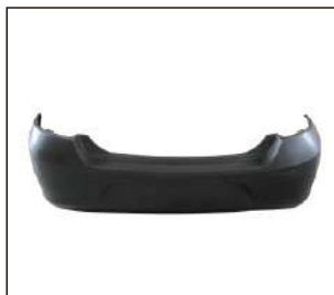
REAR BUMPER SDN 901.CV40218BA OE: