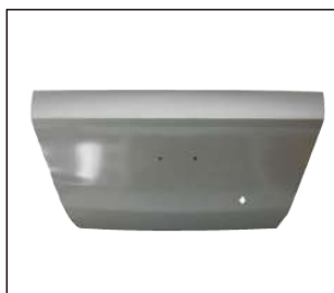
TRUNK LID SDN 928.CV90001A OE:9048646