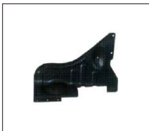
COVER ENGINE UNDER 957.CV33004 OE: