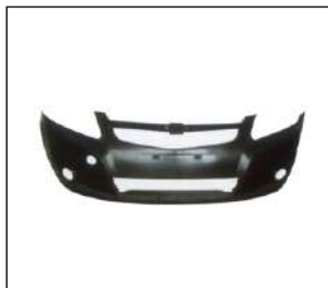
FRONT BUMPER W/FOG HOLE 901.CV40216BA OE:9031302