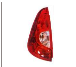
TAIL LAMP 931.CV7006 OE: