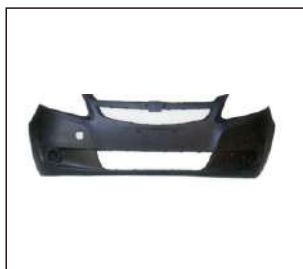
FRONT BUMPER 901.CV40217BA OE:9031302