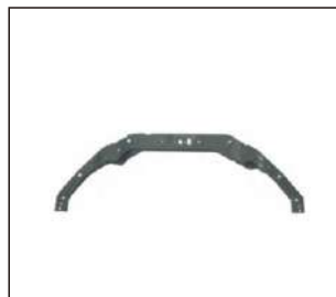
RADIATOR SUPPORT UPPER 904.CV30333A OE:9074462