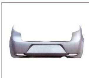
REAR BUMPER H/B 901.CV40219BA OE: