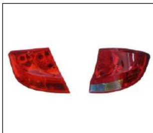
TAIL LAMP 931.CV7009 R:9070450 L:9070449