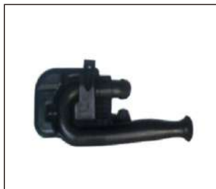
AIR FILTER HOUSING 858.CV1001 OE:9022003