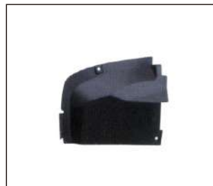
INNER FENDER REAR SDN 915.CV11271A R:9020208 L:9020207