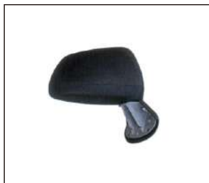
MIRROR ELECTRIC 980.CV882E R:9033814 L:9033813