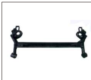
CROSSMEMBER REAR 906.CV21007A OE: