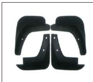
MUDGUARD 922.CV1005Z OE: