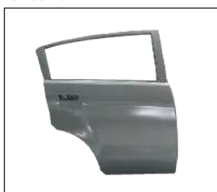
REAR DOOR H/B 907.CV28025A R: