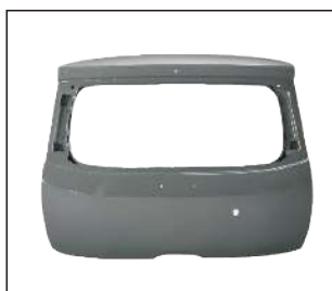
TRUNK LID H/B 928.CV90002A OE: