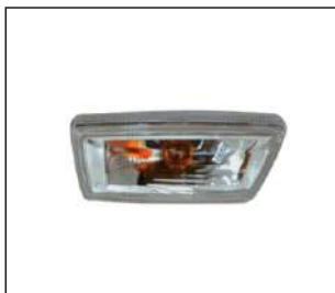
SIDE LAMP 932.CV7203 OE: