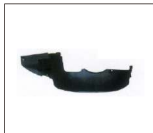
INNER FENDER SDN 915.CV11258 R:9075867 L:9048861