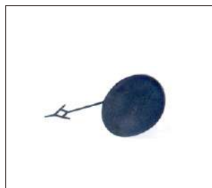
FRONT BUMPER COVER 911.CV44068A OE: