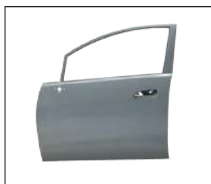
FRONT DOOR 907.CV28010A R:9028816 L:9028815