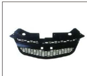
GRILLE 900.CV97152GA OE:9032223