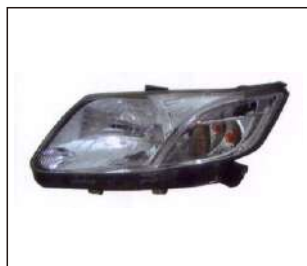
HEAD LAMP 930.CV7002 R:9016630 L:9016629