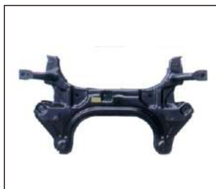
CROSSMEMBER FRONT 906.CV21006A OE:90870940