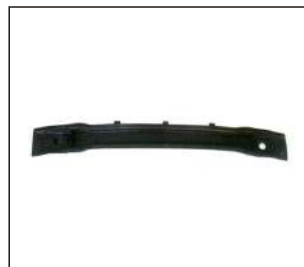
FRT BUMPER REINFORCEMENT 911.CV44052A OE:

All trademarks and vehicle models (including their names and pictures) mentioned in this catalogue are for reference only. Our production is not original replacement parts but interchangeable against original parts.