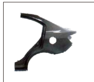
REAR FENDER 905.CV19008A R:93736320 L:93736319

All trademarks and vehicle models (including their names and pictures) mentioned in this catalogue are for reference only. Our production is not original replacement parts but interchangeable against original parts.