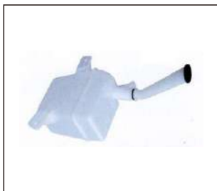
WATER POT 509.CV1007A OE:9016637