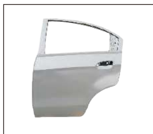
REAR DOOR SDN 907.CV28011A R:9029109 L:9029108