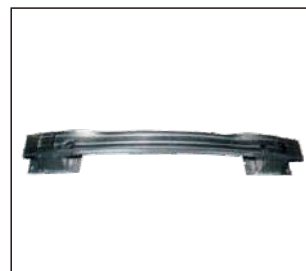
REAR BUMPER SUPPORT 911.CV44059A OE: