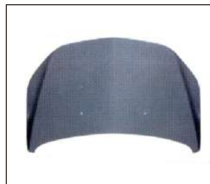
HOOD 902.CV21005A OE: