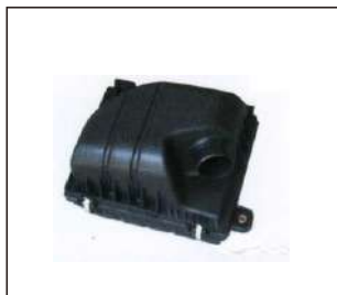
AIR FILTER CASE 241.CV2008 OE:9021999