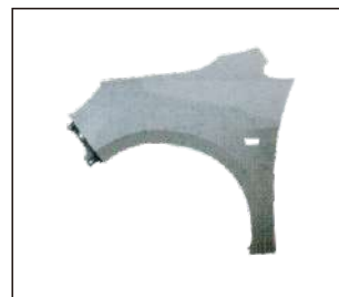
FRONT FENDER 905.CV19007A R:9074934 L:9074933