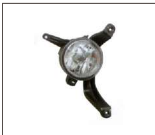
FOG LAMP 939.CV7003 R:9070450 L:9070449