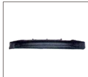
REAR BUMPER SUPPORT 4D 911.CV44086A OE: