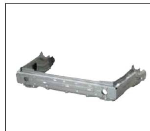
RADIATOR SUPPORT LOWER 904.CV30334A OE: