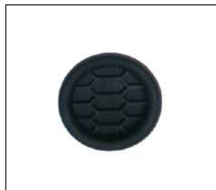
FOG LAMP COVER 913.CV1020 OE: