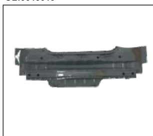
REAR PANEL 926.CV32002A OE:9074641