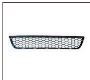
BUMPER GRILLE 901G.CV04704BA OE: