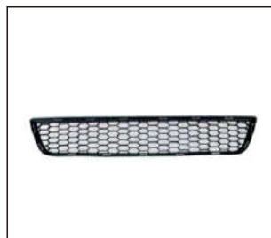
BUMPER GRILLE 901G.CV04705BA OE:9028450