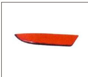
REAR BUMPER LAMP 932.CV7204 OE: