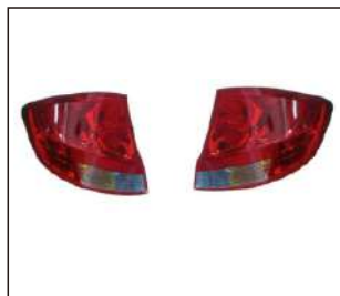
TAIL LAMP 931.CV7005 OE: