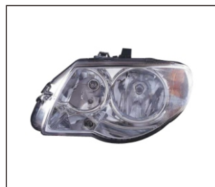
HEAD LAMP 2005-2007 930.CR7001 R:4857830 L:4857831