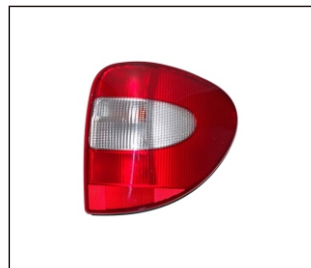
TAIL LAMP 931.CR1001 R:4857306AB L:4857307AB