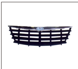
GRILLE 900.CR48052GA OE: