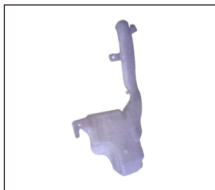
WINDSHIELD WASHER 509.CR1001A OE:04857838AC