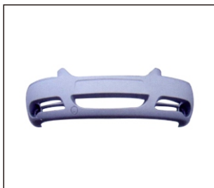
FRONT BUMPER 901.CR05001BA OE:5018639AA