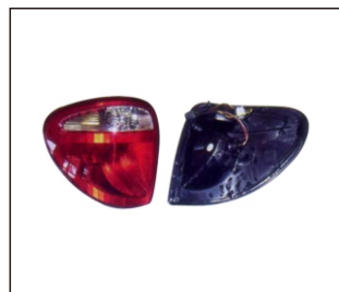
TAIL LAMP 2001-2005 931.CR1002 R: