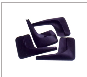
MUDGUARD 2014 922.CR1001Z OE: