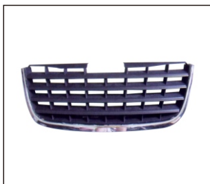
GRILLE 2008-2010 900.CR48053GA OE:05113127AA