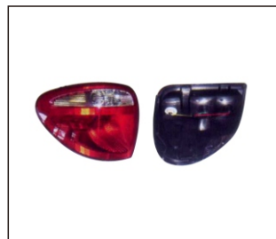
TAIL LAMP 2005-2007 931.CR1003 R: