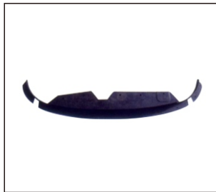
COVER, UNDER BUMPER 911.CR44005A OE:DA805857AA