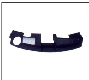
COVER RADIATOR 911.CR44003A OE:48571217AD