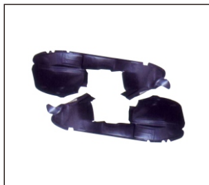
INNER FENDER 915.CR11121 R:4857428AB L:4857429AB