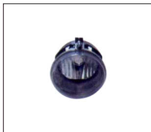
FOG LAMP 939.CR7002X OE:4805857AA