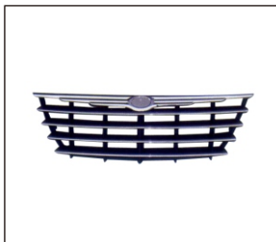
GRILLE 900.CR48051GA OE: DS605087AA