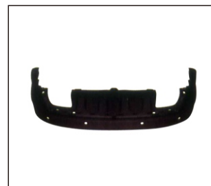
REAR BUMPER LOWER 4X4 901.CHN05017BA OE: