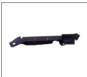
FENDER BRACKET 911.CHN01012A R: