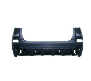
REAR BUMPER 901.CHN05015BA OE: