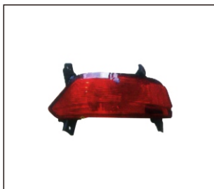
REAR BUMPER LAMP 932.CHN1004 R: