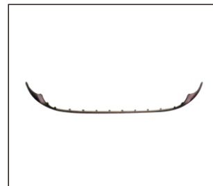
REAR BUMPER MOULDING 4X4 923.CHN01002A OE: