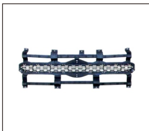
GRILLE 900.CHN08007GA OE: