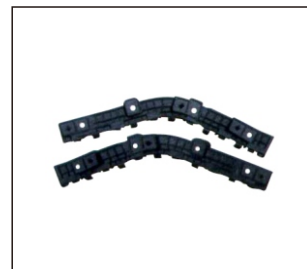
REAR BUMPER BRACKET 911.CHN01010A R:

All trademarks and vehicle models (including their names and pictures) mentioned in this catalogue are for reference only. Our production is not original replacement parts but interchangeable against original parts.