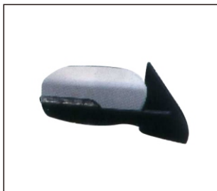
MIRROR 980.CHN1005 R: