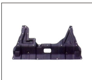
COVER, ENGINE UNDER 957.CHN33001A OE: