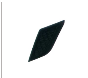
FOG LAMP COVER 913.CHN1003 R: