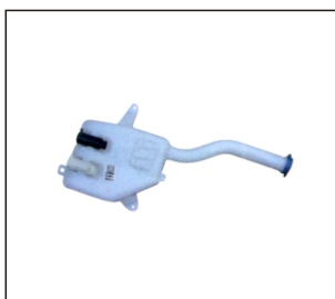
WATER POT 509.CHN1002A OE: