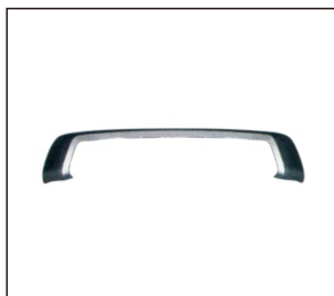
REAR BUMPER GUARD 910.CHN14004A OE: