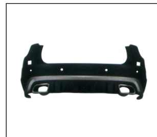
REAR BUMPER 4X4 901.CHN05016BA OE: