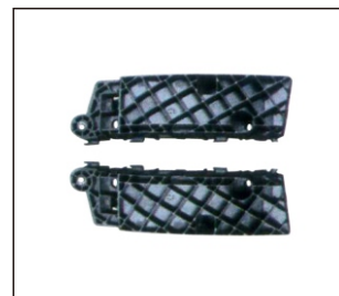
FRONT BUMPER BRACKET 911.CHN01009A R: