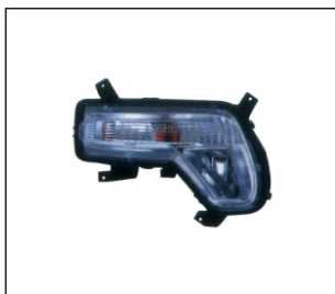
FOG LAMP 939.CHN3006 R: