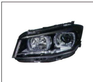
HEAD LAMP 4X4 930.CHN2007 R: