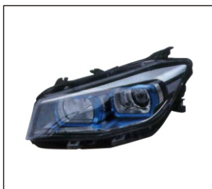
HEAD LAMP 930.CHN2006 R: