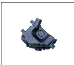
AIR FILTER CASE 241.CHN2001 OE: