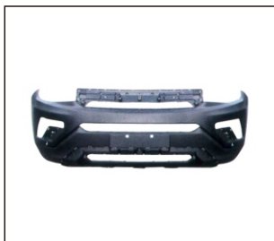
FRONT BUMPER 901.CHN05014BA OE: