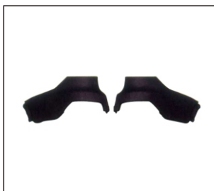
REAR SIDE BUMPER 912.CHN04002 R: