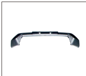
FRONT BUMPER GUARD 910.CHN14003A OE: