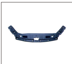
WATER TANK TOP COVER 911.CHN01011A OE: