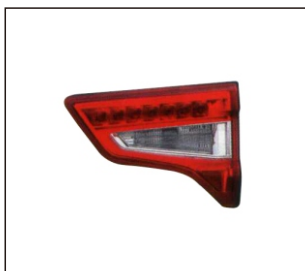
BACK LAMP 933.CHN5004 R: