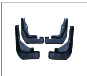
MUDGUARD 922.CHN1003Z OE: