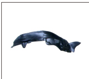
INNER FENDER 915.CHN11004A R: