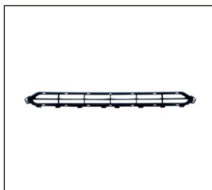
BUMPER GRILLE 901G.CHN01006BA OE: