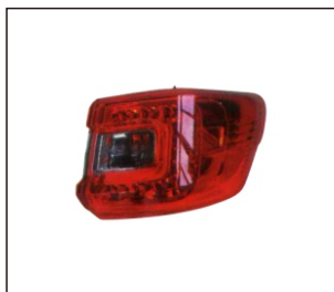
TAIL LAMP 931.CHN4007 R: