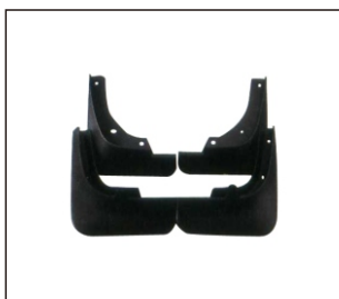
MUDGUARD 2015 MODEL 922.CHN1002Z