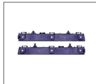
REAR BUMPER BRACKET 911.CHN01006A R:

All trademarks and vehicle models (including their names and pictures) mentioned in this catalogue are for reference only. Our production is not original replacement parts but interchangeable against original parts.