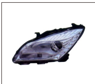
HEAD LAMP 930.CHN2004 R: