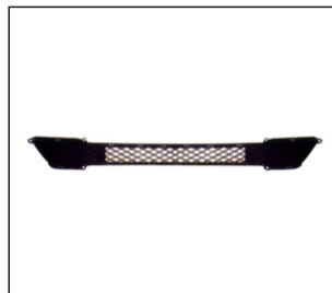
FRONT BUMPER GRILLE 901G.CHN01004BA OE: