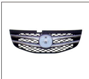
GRILLE 2015 MODEL 900.CHN08004GA OE: