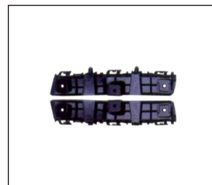
FRONT BUMPER BRACKET 911.CHN01005A R: