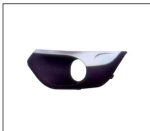
FOG LAMP COVER 913.CHN1001