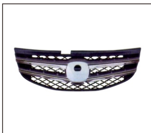
GRILLE 900.CHN08006GA OE: