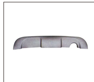
REAR BUMPER GUARD 910.CHN14002A OE: