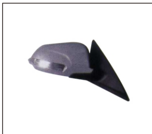
MIRROR ELECTRIC 980.CHN1004E R: