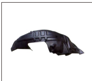
INNER FENDER FRONT 915.CHN11002A