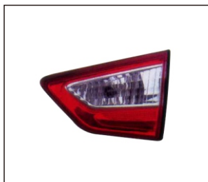
BACK LAMP 933.CHN5002 R: