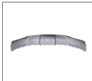
FRONT BUMPER GUARD 910.CHN14001A OE: