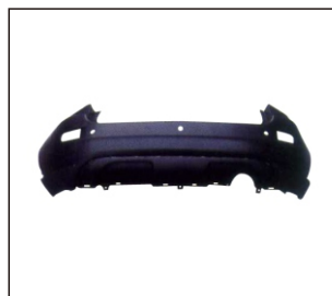
REAR BUMPER 901.CHN05010BA OE: