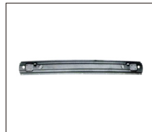
REAR BUMPER REINFORCEMENT 911.CHN01008A OE: