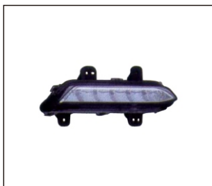
FRONT DAYTIME RUNNING LAMP 971.CHN1001 R: