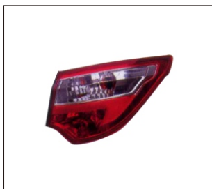
TAIL LAMP 931.CHN4005 R: