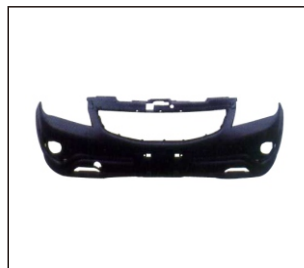
FRONT BUMPER 901.CHN05009BA OE: