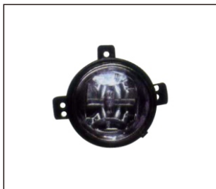
FOG LAMP 939.CHN3004 R: