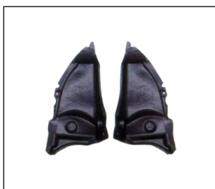
INNER FENDER REAR 915.CHN11003A