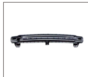
FRONT BUMPER REINFORCEMENT 911.CHN01007A OE: