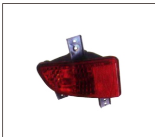
REAR BUMPER LAMP 932.CHN1003 R: