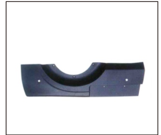
REAR BUMPER 901.CH04087BA OE: