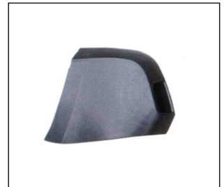
SIDE BUMPER 912.CH04001A OE: