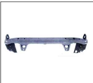
PANEL BELOW STEEL 911.CH44019A OE: