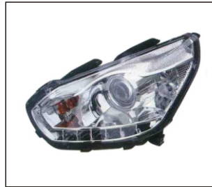
HEAD LAMP 930.CH7101 OE: