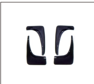
MUDGUARD 922.CH1002Z OE: