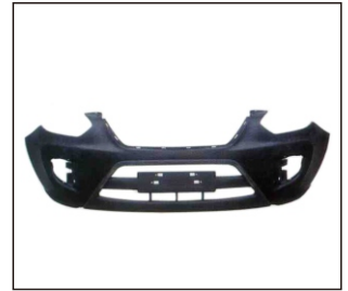
FRONT BUMPER 901.CH04088BA OE: