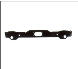
UPPER PANEL STEEL 911.CH44018A OE: