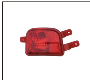
REAR FOG LAMP 932.CH9903 OE: