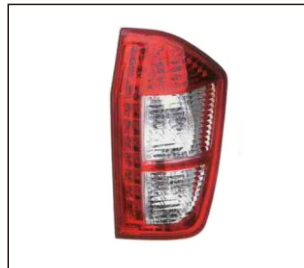
TAIL LAMP 931.CH9005 OE: