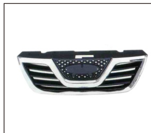
GRILLE 900.CH07902GA OE: