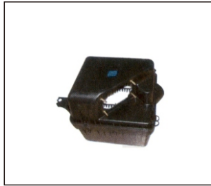
AIR FILTER CASE 241.CH2002 OE:T11 1109110