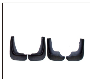
MUDGUARD 922.CH1003Z OE: