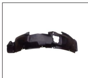
INNER FENDER FRONT 915.CH11008 R:A13-3102022 L:A13-3102021