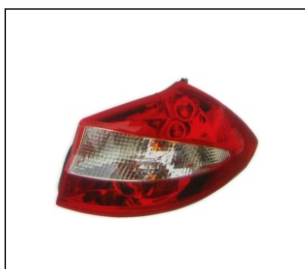
TAIL LAMP SDN 931.CH9007 R:J15-3773020 L:J15-3773010