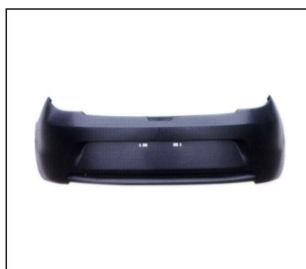
REAR BUMPER SDN 901.CH04082BA OE:A13-2804500