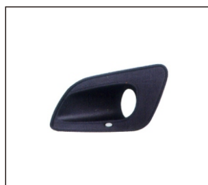
FOG LAMP COVER 913.CH5002 R:A13-2803534 L:A13-2803533