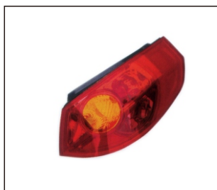
TAIL LAMP H/B 931.CH9006 OE: