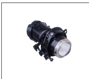
FOG LAMP 939.CH3006 R:A13-3732020 L:A13-3732010