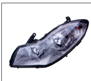
HEAD LAMP ELECTRIC 930.CH7102E OE: