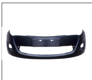
FRONT BUMPER 901.CH04081BA OE:A13-2803501