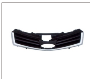
GRILLE 900.CH07903GA OE:A13-8401010