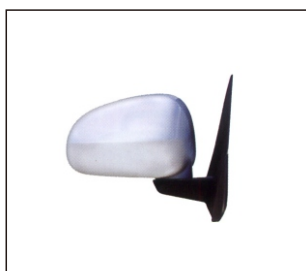
MIRROR ELECTRIC 980.CH091E R:A13-8202020 L:A13-8202010