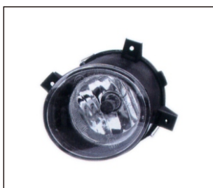
FOG LAMP 39.CH3008 OE: