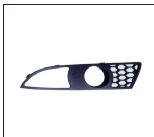
FOG LAMP COVER 913.CH5003 OE: