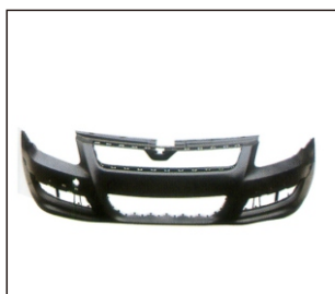
FRONT BUMPER 901.CH04084BA OE: