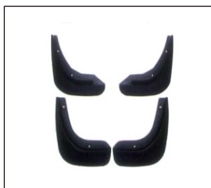
MUDGUARD 922.CH1005Z OE: