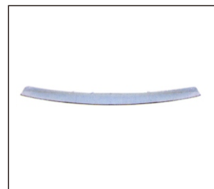
HOOD MOULDING 923.CH01005A OE: