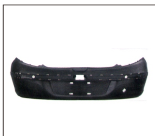
REAR BUMPER 4D 901.CH04085BA OE: