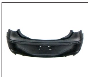
REAR BUMPER 5D 901.CH04086BA OE: