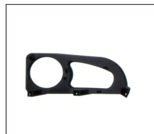
CORNER BRACKET 911.CH44023A OE: