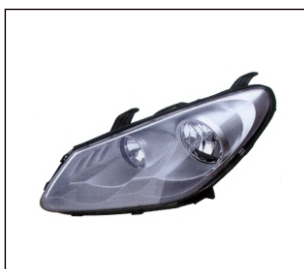
HEAD LAMP 930.CH7103 OE: