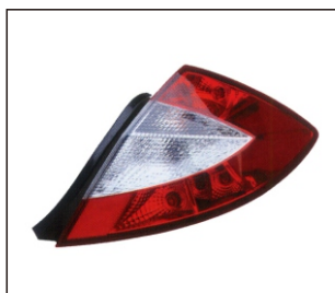
TAIL LAMP SDN 931.CH9008 OE: