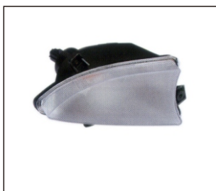
FOG LAMP 939.CH3007 OE: