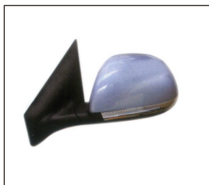
MIRROR 980.CH092E OE: