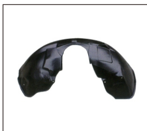
INNER FENDER 915.CH11010 OE: