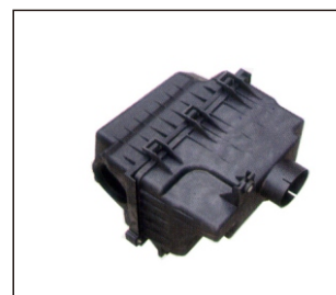
AIR FILTER CASE 241.CH2003 OE: