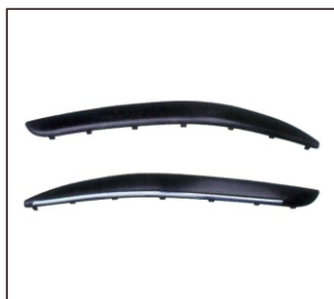
FRONT BUMPER MOULDING 923.CH01004 OE: