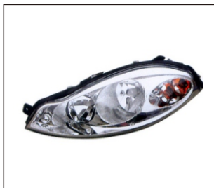
HEAD LAMP ELECTRIC 930.CH1005E