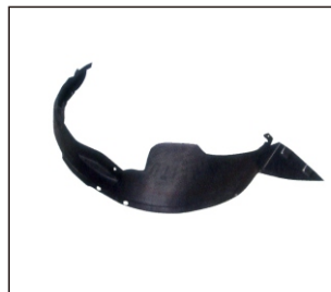
INNER FENDER 915.CH11007