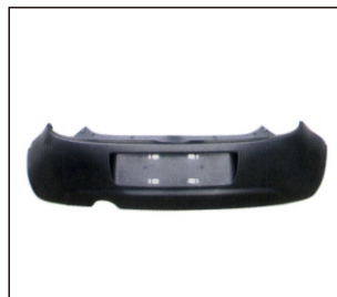
REAR BUMPER 901.CH04097BA