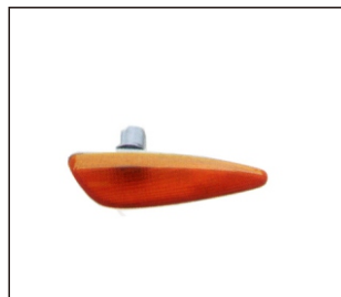
SIDE LAMP 932.CH9905