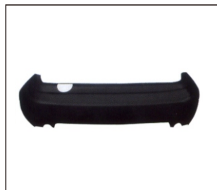
REAR BUMPER 901.CH04096BA