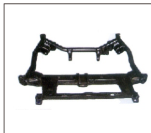
RADIATOR SUPPORT 904.CH31003A