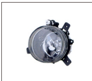
FOG LAMP 939.CH3005