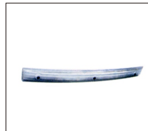
HOOD MOULDING 911.CH44021A