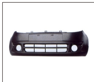
FRONT BUMPER 901.CH04095BA