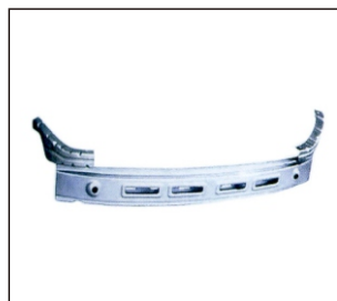
FRONT BUMPER SUPPORT 911.CH44010A