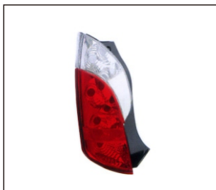
TAIL LAMP 931.CH9004