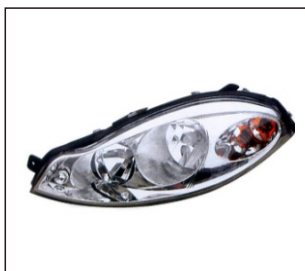
HEAD LAMP MANUAL 930.CH1005