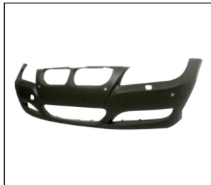
F. BUMPER W/WASHER W/SENSOR 901.BM04052BA OE:51117204249