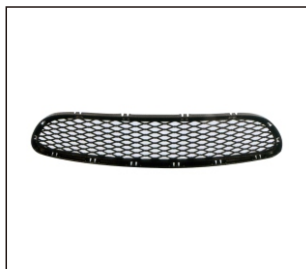
BUMPER GRILLE 901G.BM07040GA OE:51117198906