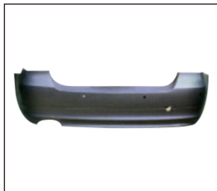
REAR BUMPER W/O SENSOR HOLE 901.BM04053BA OE: