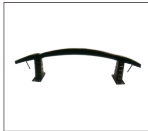
FRONT BUMPER REINFORCEMENT 911.BM44074A OE:51117146645