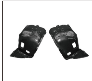
FRONT INNER FENDER 915.BM11013 R:51717059380 L:51717059379