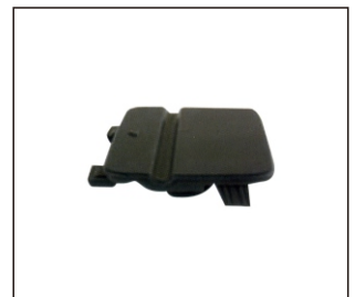
REAR TOW COVER 901C.BM11002 OE:51127202673

All trademarks and vehicle models (including their names and pictures) mentioned in this catalogue are for reference only. Our production is not original replacement parts but interchangeable against original parts.