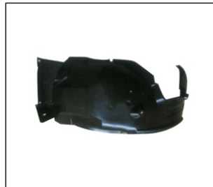
REAR INNER FENDER 915.BM11041 R:51717059378 L:51717059377