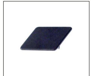
WASHER COVER 901C.BM11001 R:61677211210 L:61677211209