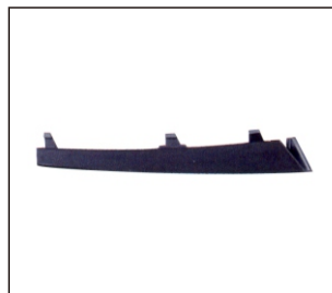
MOULDING OF FRONT BUMPER 923.BM98306 R:51117198900 L:51117198899