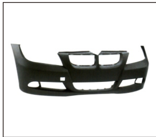
F BUMPER W/O WASHER W/O SENSOR 901.BM04051BA OE:51117204242