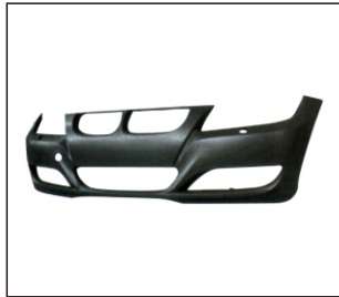
F. BUMPER W/WASHER W/O SENSOR 901.BM04050BC OE:51117204248