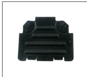
INNER FENDER COVER 911.BM44099A R:51717143850 L:51717143849