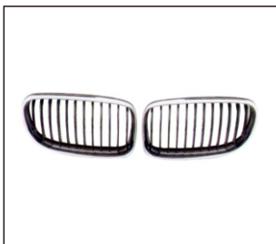
GRILLE 900.BM07029GA HALF CHROME 900.BM07030GA BLACK OE: