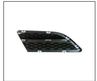
BUMPER GRILLE SIDE 901G.BM07041GA R:51117138418 L:51117138417