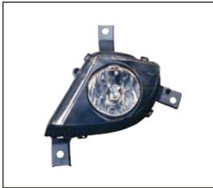
FOG LAMP 939.BMA809 R:63177199894 L:63177199893