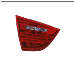
BACK LAMP 933.BM7319 R: