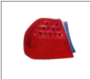
TAIL LAMP 931.BMB677 R: