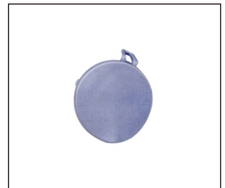
FRONT TOW COVER 901C.BM11003 OE:5117207299