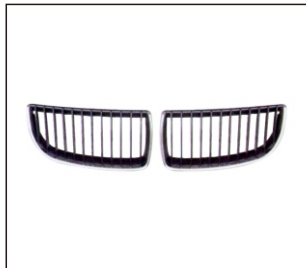
GRILLE BLACK 900.BM07025GB R:5113-7120-008 L:5113-7120-007