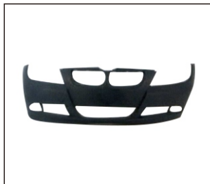
FRONT BUMPER 901.BM04023BA OE:51117140859