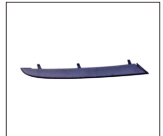
BUMPER GRILLE STRIPE 923.BM98301 R:5111-7134-092 L:5111-7134-091