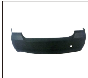
REAR BUMPER W/O SENSOR W/TOW HOLE 901.BM04027BA OE:51127141053