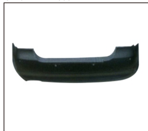
REAR BUMPER W/ SENSOR W/TOW HOLE 901.BM04028BA OE:51127171045