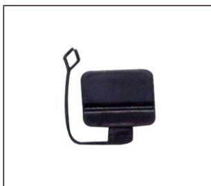
REAR TOW COVER 901C.BM11005 OE:5112-7187-542