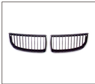
GRILLE 900.BM07025GA OE: