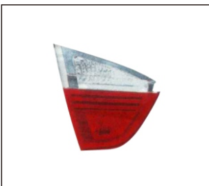
BACK LAMP 933.BM1309 R:63216937460 L:63216937459