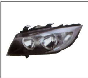
HEAD LAMP 930.BM1149 R:63116942722 L:63116942721