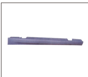
SIDE SKIRT 908.BM33004 R:5177-7164-796 L:517-7164-795