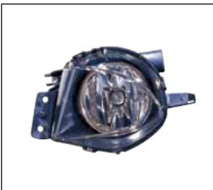
FOG LAMP 939.BMA469 R:63176948374 L:63176948373