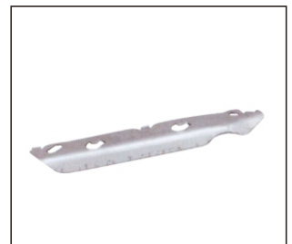
FRONT BUMPER REINFORCEMENT 911.BM44101A R:5111-7134-098 L:5111-7134-097

All trademarks and vehicle models (including their names and pictures) mentioned in this catalogue are for reference only. Our production is not original replacement parts but interchangeable against original parts.