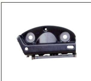
TAIL LAMP BRACKET 911.BM44102A R:5112-7118-194 L:5112-7118-193