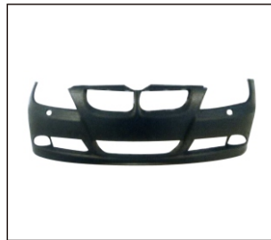
FRONT BUMPER W/O SENSOR W/ WASHER 901.BM04026BB OE:51117170052