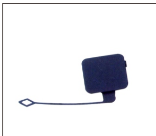
FRONT TOW COVER 901C.BM11004 OE:5111-7167-575