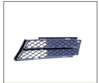
BUMPER GRILLE 901G.BM07027GA R:5111-7134-082 L:5111-7134-081