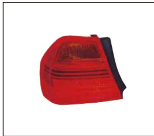
TAIL LAMP 931.BM1930 R:63216937458 L:63216937457