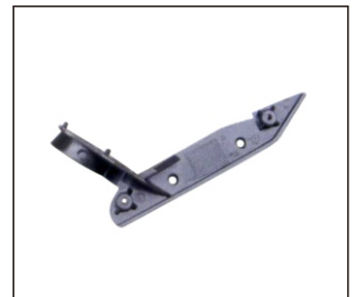
FRONT BUMPER BRACKET 911.BM44100A R:5111-7058-448 L:5111-7058-447