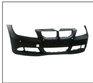
FRONT BUMPER W/SENSOR W/O WASHER 901.BM04026BA OE:51117170051