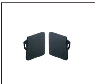
WASHER COVER 901C.BM11006 R:61678031307 L:61678031308