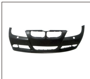
FRONT BUMPER W/SENSOR W/ WASHER 901.BM04023BB OE:51117170053