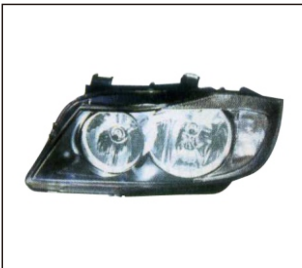
HEAD LAMP 930.BM1156 R:63116942748 L:63116942747