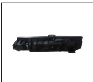
WATER TANK BRACKET 911.BM44103A OE:1710-7524-912