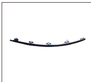
FOG LAMP CASE MOULDING 923.AD55190 OE: