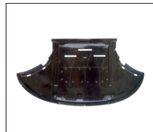
COVER ENGINE UNDER 957.AD11004A OE:4FD863821