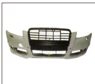
FRONT BUMPER W/SENSOR HOLE 901.AD04992BA OE:4F0807105AB