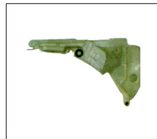
WATER TANK 509.AD1006 (BIG HOLE) 509.AD1007 (SMALL HOLE) OE:4F0955453R / M

All trademarks and vehicle models (including their names and pictures) mentioned in this catalogue are for reference only. Our production is not original replacement parts but interchangeable against original parts.