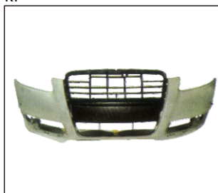
FRONT BUMPER W/O SENSOR HOLE 901.AD04992BB OE:4F0807105AA