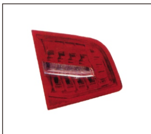
BACK LAMP LED 933.AD1309 R:4FD945094 L:4FD945093