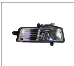
FOG LAMP 939.ADA865 R 4F0941700A L 4F0941699A