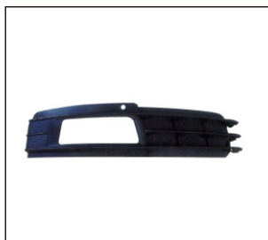
FOG LAMP COVER 913.AD11004HA R 4F0807682H L 4F0807681H