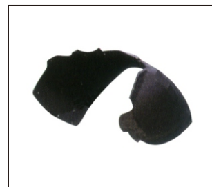
INNER FENDER FRONT 915.AD11192A R:4F0821134H L:4F0821133H