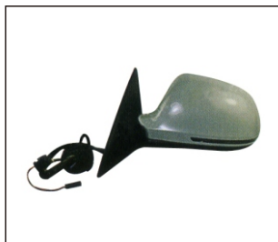
MIRROR W/LAMP 980.AD049E ELECTRIC 980.AD049T ELECT W/HEATER R: