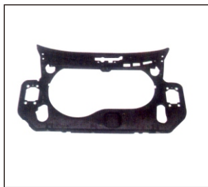
RADIATOR SUPPORT 904.AD30198A OE:4F0805594C