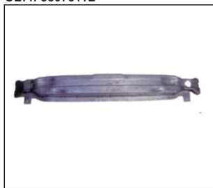
FRONT BUMPER REINFORCEMENT 911.AD44014A OE:4F0807111E