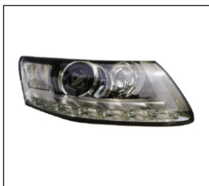
HEAD LAMP 930.ADC027E R 4F0941004BP L 4F0941003BP