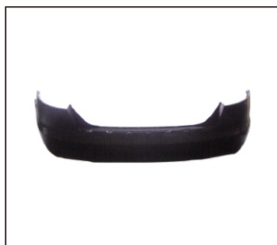
FRONT BUMPER 901.AD04993BA W/ Sensor Hole 901.AD04993BB W/O Hole OE:4F5807511E