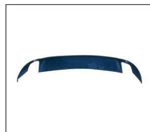
REAR BUMPER SPOILER 903.AD05106VA OE:4F0807521A