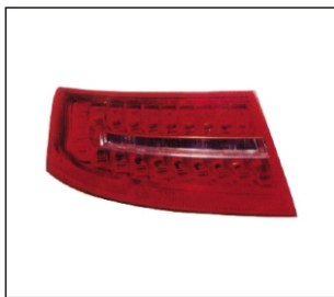
TAIL LAMP 931.AD1915 R:4FD945096E L:4FD945095E