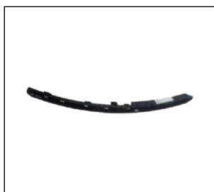
HEAD LAMP MOULDING 923.AD55189 R 4F0807490 L 4F0807489