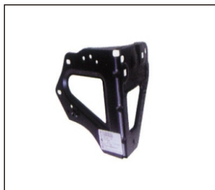
FENDER BRACKET 911.AD44015A R 4FD821136 L 4FD821135