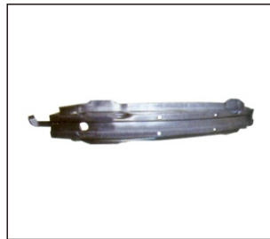
FRONT BUMPER REINFORCEMENT 911.AD44004A OE:8E0807109C