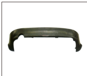
REAR BUMPER APRON 903.AD05108VA OE:8E5807521A