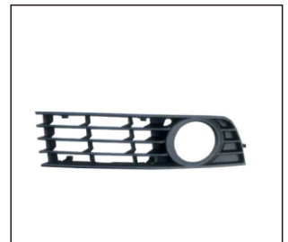
FOG LAMP COVER 901G.AD0713GA R:8E0807682 L:8E0807681