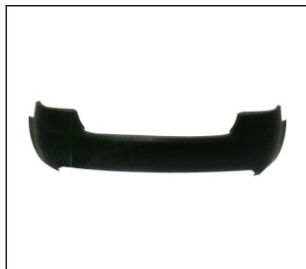
REAR BUMPER 901.AD04014BA OE:8E0807301