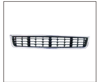
BUMPER GRILLE 901G.AD07012GA OE:8E0807647