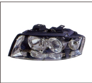
HEAD LAMP 930.ADA007 R:8E0941029H L:8E0941030H