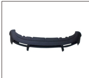
FRONT APRON 903.AD05104VA OE:8E0807110