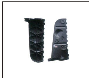
REAR BUMPER BRACKET 944.AD45183A R:8E0807454 L:8E0807453