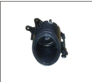
FOG LAMP 939.ADA227 R:8E0941700B L:8E0941699B