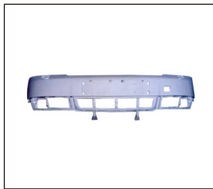
FRONT BUMPER 901.AD04013BB OE:8E0807103F