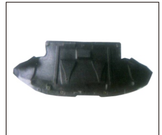
COVER ENGINE UNDER 957.AD11003A OE:8E0863821AC/AR/AN