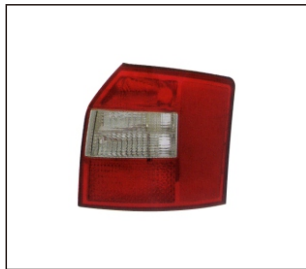
TAIL LAMP 931.AD1971 R:8E9945096B L:8E9945095B