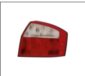
TAIL LAMP 931.AD1964 R:8E5945218A L:8E5945217A