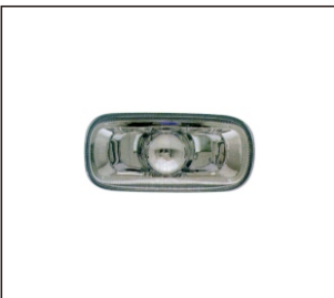
SIDE LAMP 932.AD7003 OE:8E0949127