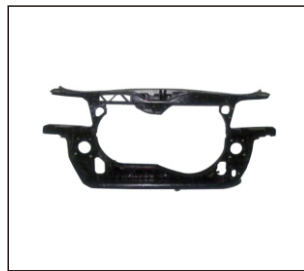
RADIATOR SUPPORT 1.8 904.AD30196A OE:8E0805594