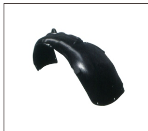
INNER FENDER 915.AD11216 R:8E0807172C L:8E0807171C