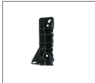
FRONT BUMPER BRACKET 944.AD45182A R:8E0807228 L:8E0807227