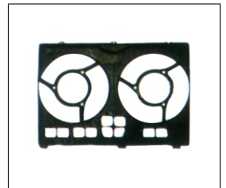
FAN SHROUD 2.6 512.AD2004A R: