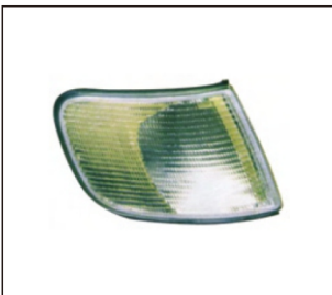
CORNER LAMP 938.AD5001C R:4A0953050 L:4A0953049