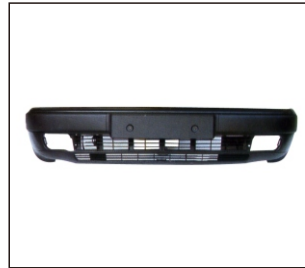
FRONT BUMPER 901.AD04161BA OE:4A0807103DA