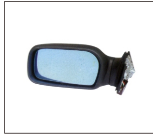
MIRROR ELECTRIC W/HEATER 980.AD005E R: