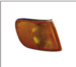
CORNER LAMP 938.AD5001A R:4A0953050 L:4A0953049