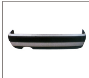
REAR BUMPER 901.AD04162BA R:4A0807305