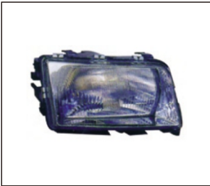
HEAD LAMP 930.AD1113 R:1AF006120-201 L:1AF006121-201