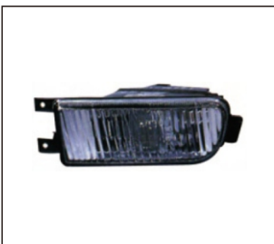
FOG LAMP 939.AD2026 R:4A0941700 L:4A0941699