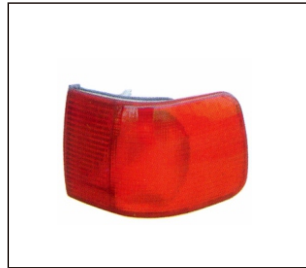
TAIL LAMP 931.AD1925 R:4A5945218 L:4A5945217