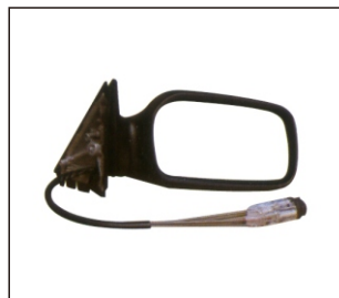
MIRROR 980.AD005 R:4A1857537C L:4A1857536C