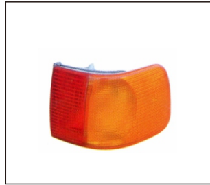
TAIL LAMP 931.AD1923 R:4A5945218 L:4A5945217