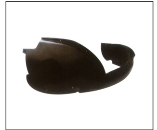
INNER FENDER 915.AD11215 R:4A0810172C L:4A0810171C