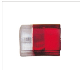
BACK LAMP 933.AD1157 R:4A0945093 L:4A0945094