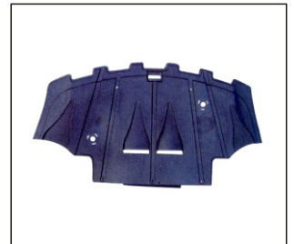
COVER ENGINE UNDER 957.AD11005A R:4A0863821AM