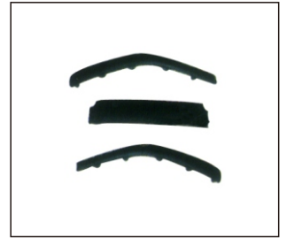
FRONT BUMPER MOULDING 923.AD55132Z OE:4S0807221 / 222 / 287