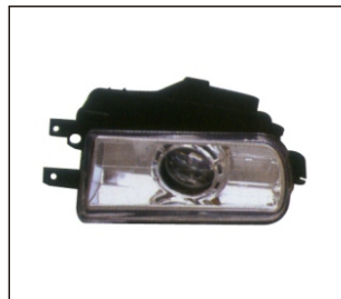
FOG LAMP 939.AD7003 R: