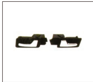
INNER DOOR HANDLE 881.AD1136Z R 443837020 L 443839019