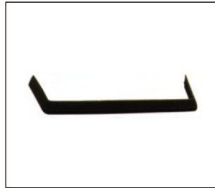
REAR BUMPER 901.AD04130BA OE:443807301