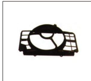
FAN SHROUD 515.AD1138 OE:443121207