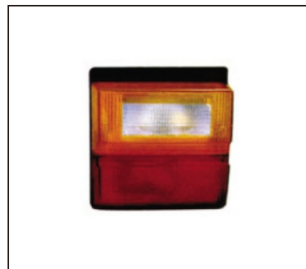
BACK LAMP 933.AD1301 R 443945226 L 443945225