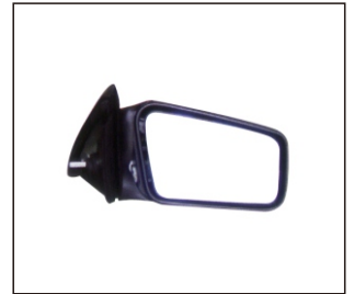
MIRROR ELECTRIC W/HEATER 980.AD003T R: