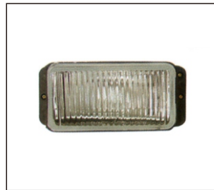
FOG LAMP 939.AD7002R/L OE: