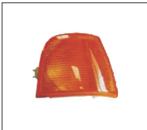
CORNER LAMP 938.AD1910 R 443953050E L 443953049E