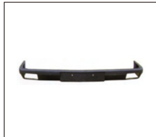
FRONT BUMPER 901.AD04003BB OE:443801101C