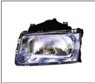
HEAD LAMP 930.AD5009 R 443941030E L 443941029E