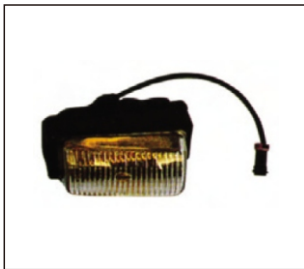
FOG LAMP 939.AD2002 OE:443941699E