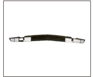
BUMPER GRILLE 901G.AD11011GA OE:443853667