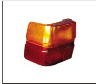
TAIL LAMP 931.AD1914 R 443945218 L 443945217