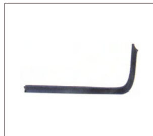
H/LAMP MOULDING 923.AD55127Z R 443805617 L 443805618