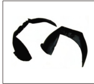
INNER FENDER 915.AD11099 R 443821111B L 443821111C